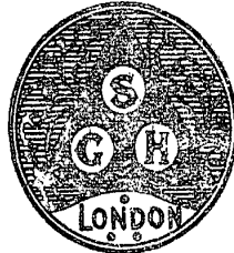
THREE CIRCLE BRAND.