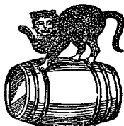
CAT AND BARREL BRAND