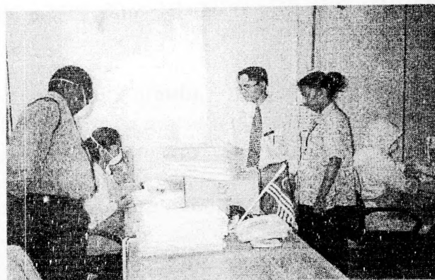
Training at National Archives Malaysia

The course was conducted under the Malaysian Technical Cooperation Programme (MTCP) and organised by the National Archives of Malaysia.