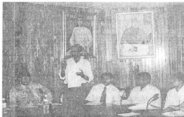
Workshop on Conservation and Preservation