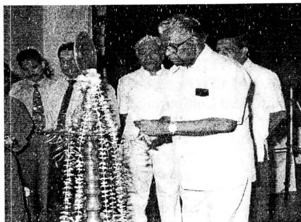
Felicitation to Professors