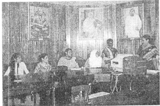
Maldivian Librarians at the NLDC

A one day training programme was conducted by the National Library and Documentation Centre on the 27 th of August, 2002 for the Maldivian Librarians following the Sri Lanka Library Association Distance Education Programme. Six Maldivian Librarians participated at the training.