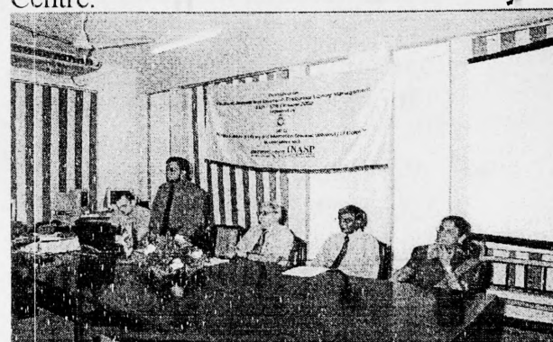
Workshop on Electronic Journals and Electronic Resources Library Management

Two workshops were conducted on 5 th and 11 th October, 2002 at the University of Colombo for library professionals, under the aegis of INASP (International Network for the Availability of Scientific Publications), to introduce PERI resources and their usefulness to Sri Lankan libraries. Similar workshop was held at the National Library on 20 th November 2002 to create an awareness on Peri among the officers of the National Library and Documentation Centre.