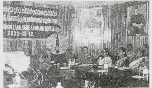
National Union Catalogue Seminar

The objective of the seminar was to improve the participation and contribution to the NUC project by the member libraries.