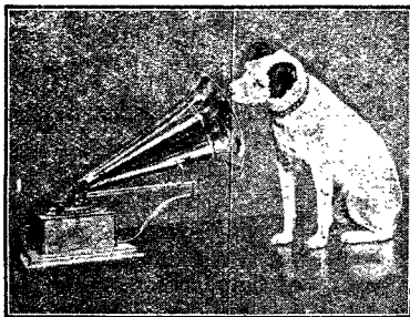
HIS MASTER'S VOICE