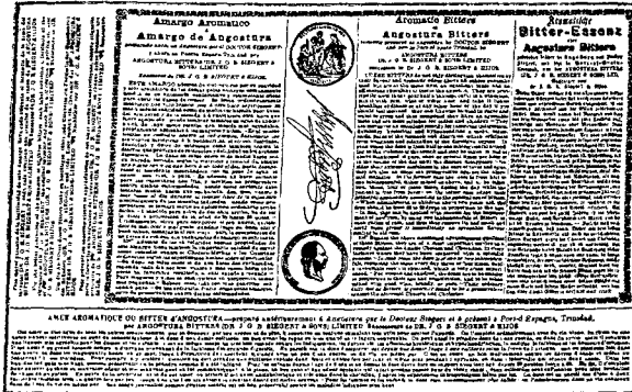
To be associated with the Trade Mark No. 5,021 under Section 24.

(1) Trade Mark No. 6,168. (2) Date of Receipt : March 28, 1935. (3) Applicant (Proprietor of the Trade Mark) : ANGOSTURA BITTERS (DR. J. G. B. SIEGERT & SONS) LIMITED, a Company incorporated under the laws of Trinidad) 6 & 8, George street, Port of Spain, Trinidad; Bitters Manufacturers and Merchants. (4) Address for service in the Island : Julius & Creasy, Colombo. (5) Class : 43. (6) Goods : Bitters (alcoholic and not medicated). (7) Representation of the Trade Mark :