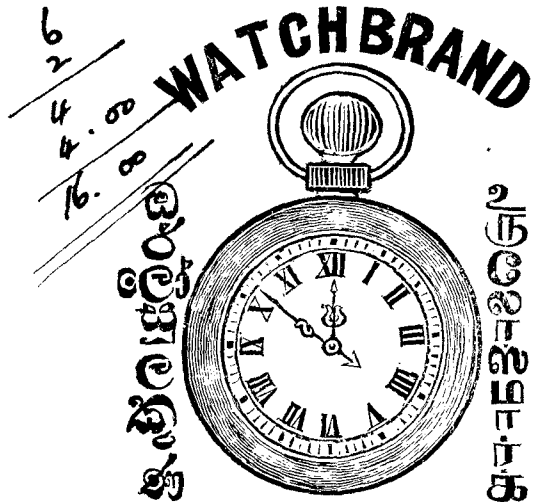
The translation of the Sinhalese and Tamil words appearing on this mark is "Watch Mark".

(1) Trade Mark No. 6,237. (2) Date of Receipt : July 15, 1935. (3) Applicant (Proprietor of the Trade Mark) : The firm trading as ABDULHUSSAN DAVOODBHOY , No. 50, Dam street, Pettah, Colombo ; General Merchants. (4) Class : 42. (5) Goods : Substances used as food or as ingredients in food excluding tea. (6) Representation of the Trade Mark :