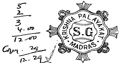
Registration of this trade mark shall give no right to the exclusive use of the initials "S. G."