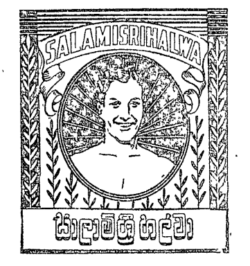
The transliteration of the Sinhalese words appearing in the mark is "Salamisrihalwa".

(1) Trade Mark No. 7,996. (2) Date of Becent: August 24, 1942. (3) Appleant (Protrictor of the Trade Mark): THE MERCANTILE EMPLOYEES PRADING COMPANY LIMITED (a Company registered in Ceylon under Ordinando No. 51 of 1938), 29, Dam street, Pettah, Colombo; merchant (4) Class: 3. (5 the Trade Mark: (5) Goods: Medicines. (6) Representation h