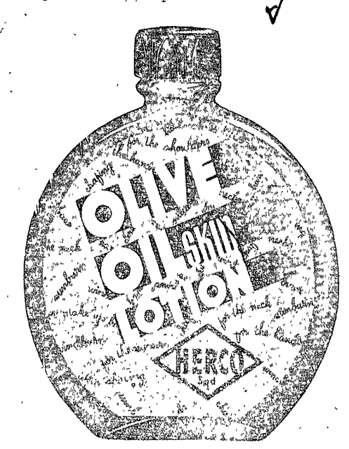
Name or description of goods varies in use.

(1) Trade Mark No, 7,953. (2) Date of Beccipt: April 8, 1942. (3) Applicant (Proprietor of the Trade Mark): STE-PHEN HERCZOG trading as HERCO CHEMICAL COM-PANY, 182-194; Chalmers, street, Sydnoy, State of New South Wales, Commonwealth of Australia; manufacturer. (4) Address for service in the Island, c/o Julus & Greasy, Fort, Colombo. (5) Class: 48. (6) Goods: Toilet preparations containing olive oil. (7) Representation of the Trade Mark: