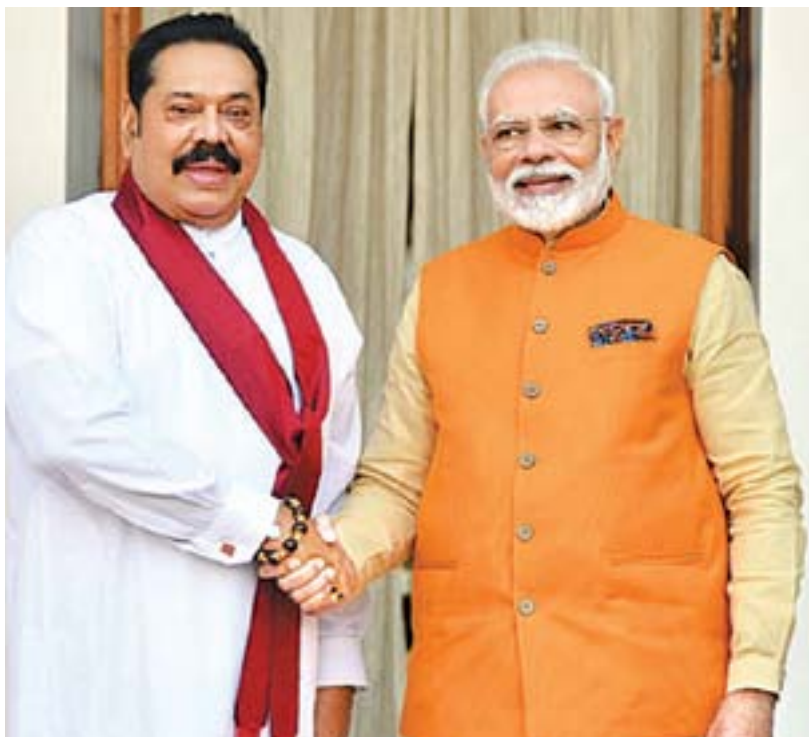
Prime Minister Mahinda Rajapaksa and Indian Prime Minister Narendra Modi

India looms as the largest nation in South Asia and in many ways the subcontinent is defined by her. It is natural that our neighbours feel insecure about their "independence and identity". Setting aside the obsession with the huge amounts that China is investing in our neighbourhood, let's begin by simply respecting the complexities of our South Asian neighbours. It may be prudent to revisit the aspects of the Gujral doctrine, which emphasise the need for good faith and trust as the basis of India's relations with its South Asian neighbours.