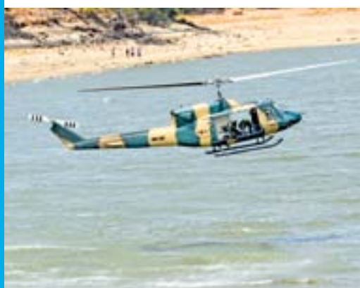
SLAF Bell Surveillance Helicopter

Australia identifies Sri Lanka, an Indian Ocean neighbour, as a key regional node in terms of maritime security. Its geographic position and good infrastructure make it an excellent hub for access to South Asia and much of the Northern Indian Ocean. The growing relationship between Australia and India may be just the first step in an expanded South Asian engagement by Australia, resulting in greater presence and purpose in the Indian Ocean region through closer cooperation with Sri Lanka.