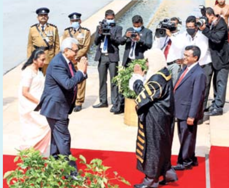
President Gotabaya Rajapaksa and First Lady Ayoma Rajapaksa welcomed by Speaker Mahinda Yapa Abeywardena on arrival in Parliament.

As I have pledged, the launch of the methodical mechanism to protect the people against social evils such as the activities of the underworld and the drug menace that have been a hindrance to the