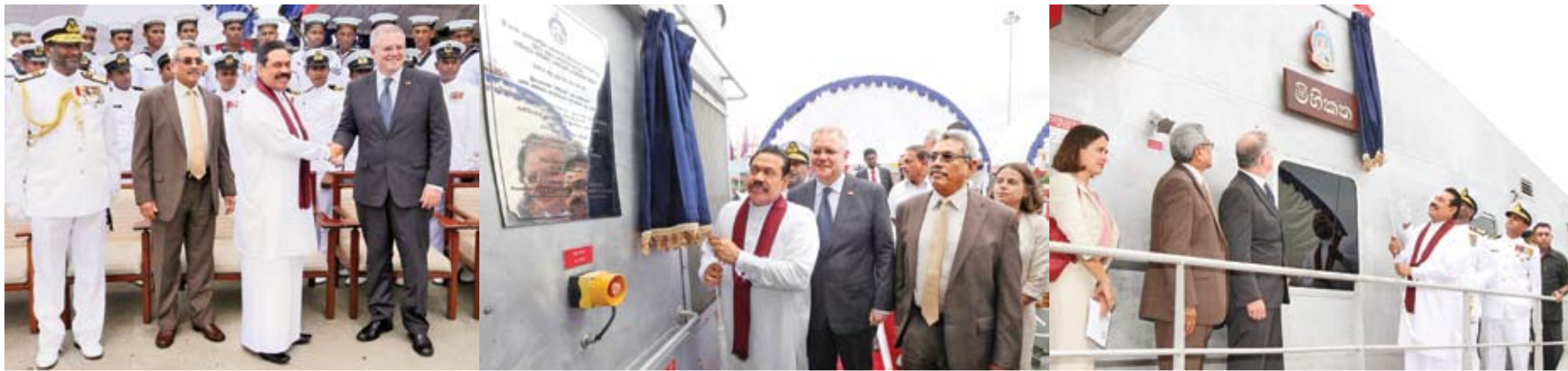
Then President and present Prime Minister Mahinda Rajapaksa and then Defence Secretary and present President Gotabaya Rajapaksa with then Australian Immigration Minister and present Prime Minister Scott Morrison at the Colombo Port commissioning the "Mihikatha" and "Ratnadeepa" Patrol Boats gifted by Australia to the Sri Lanka Navy in 2014