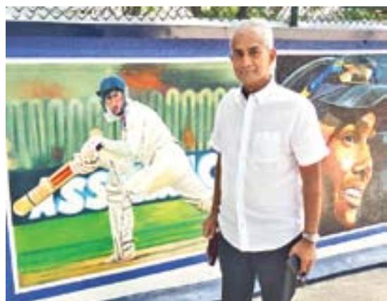
Sidath Wettimuny standing in front of his drawing.