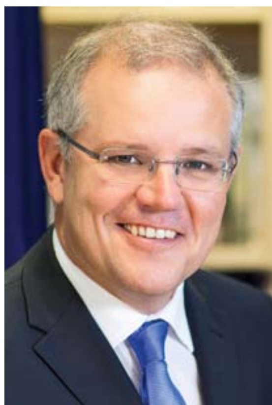
Australian Prime Minister Scott Morrison

The geographic positions of Australia and Sri Lanka as entry points into their respective regions also provide opportunities for cooperation, including exploring the enhancement of air power by establishing key