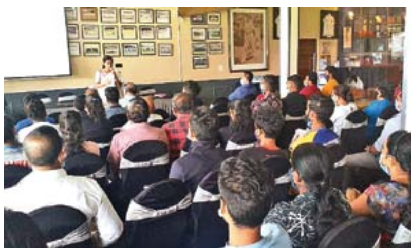
The participants are briefed by one of the instructors.