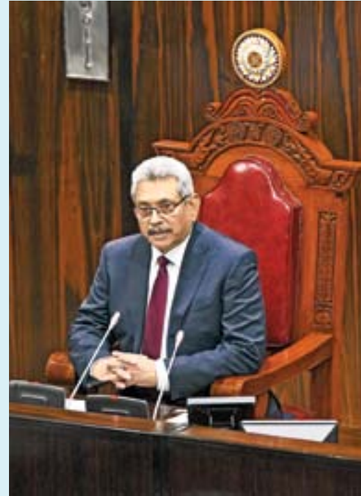
President Gotabaya Rajapaksa addressing the inaugural session in Parliament on Thursday.

People are of the view that they are not getting the expected service from the public service in an efficient manner. Therefore, I request all the Ministers and State Ministers to take steps to provide fast and efficient service to the public via Ministries, Departments and Institutions that come under their purview. During my recent visits to several State institutions, I observed that some institutional procedures of those institutions do not add any value to the government or to the public but only waste the time of the public. You should identify new methods to provide efficient, speedy and convenient service to the public instead of continuing with prevailing traditional methods. You need to re-engineer the processes for greater productivity and customer satisfaction. We should find new technological solutions in this regard.