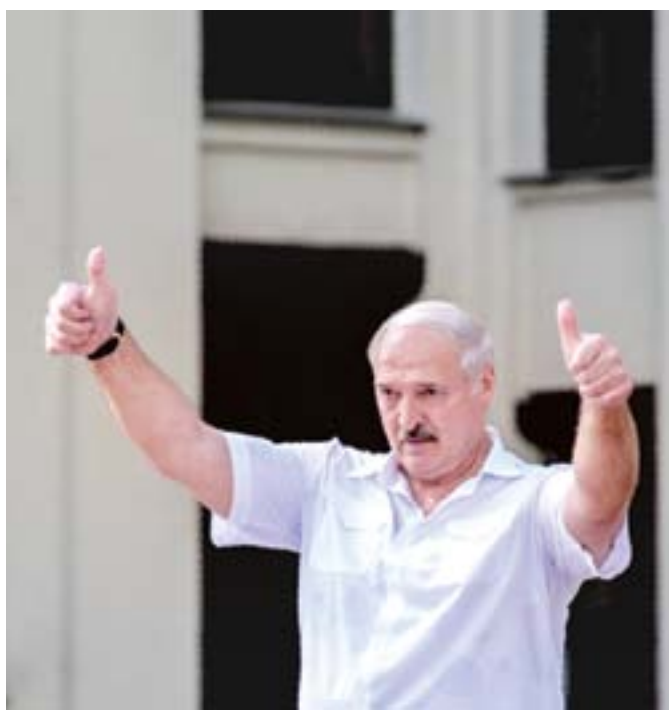
Belarus' President Alexander Lukashenko gestures to supporters.

The dramatic events in one of Africa's most volatile countries began early Tuesday, when rebel officers mutinied at a base near Bamako and headed into the city, where they detained President Keita and PM Cisse. Hours later, Keita—beset by angry protests over economic stagnation, corruption and a brutal Islamist insurgency—announced his resignation. He said he had been given no other choice but to quit, and sought to avoid bloodshed.