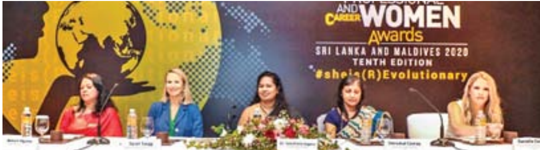
Members in the head table

With over 420 past award winners, representing a wide array of professions such as banking and finance, hospitality, media, legal, logistics and supply chains, the 'Top 50' Professional and Career Women Awards, "demonstrates the significant role women play in bringing about transformational