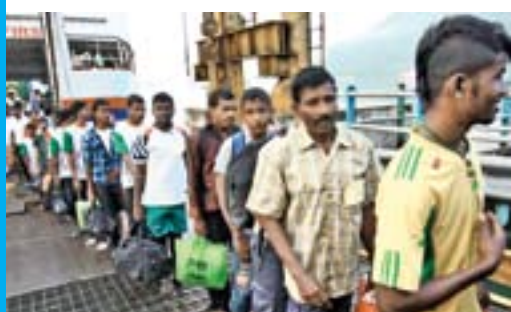
Sri Lankan illegal immigrants intercepted by Australia

Australia identifies Sri Lanka, an Indian Ocean neighbour, as a key regional node in terms of maritime security. Its geographic position and good infrastructure make it an excellent hub for access to South Asia and much of the Northern Indian Ocean. The growing relationship between Australia and India may be just the first step in an expanded South Asian engagement by Australia, resulting in greater presence and purpose in the Indian Ocean region through closer cooperation with Sri Lanka.