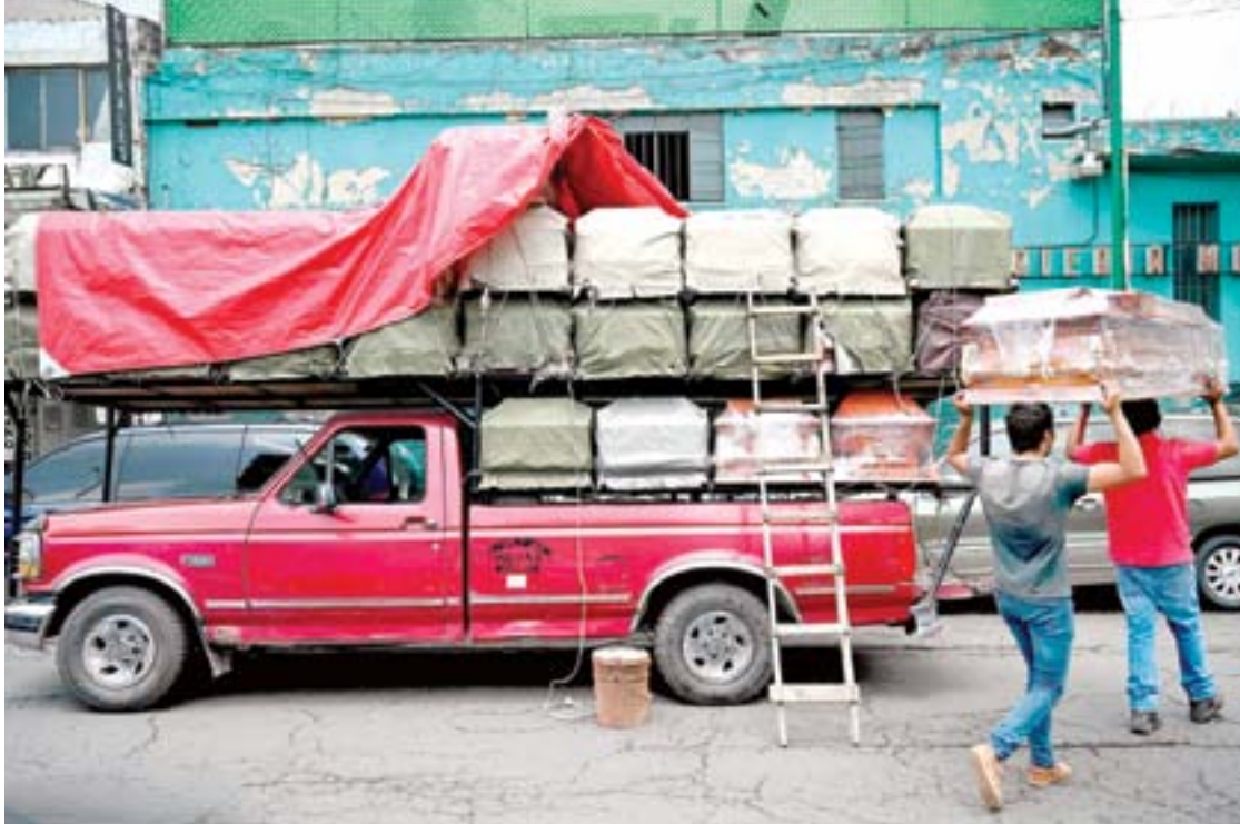
Workers unload coffins from a truck outside a funeral home located in front of the General Hospital in Mexico City on Thursday amid the COVID-19 coronavirus pandemic.

Latin America and the Caribbean recorded nearly 6.5 million infections and 250,969 deaths on