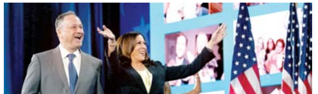
Senator from California and Democratic Vice Presidential nominee Kamala Harris and her husband Doug LaMalfa wave on stage at the end of the last day of the Democratic National Convention in Wilmington, Delaware on Thursday.

After Kamala's parents separated when she was about five years old, her mother raised her and her younger sister.