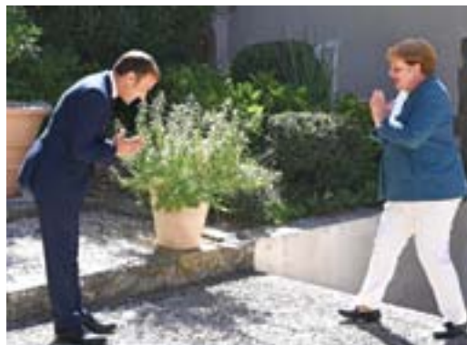
French President Emmanuel Macron (L) greets German Chancellor Angela Merkel as she arrives at Fort de Bregancon in Bormes-les-Mimosas, France on Thursday where a number of issues including the tense situation in Belarus were discussed.

Macron said Thursday that he, Merkel, and EU chief Charles Michel have had "several exchanges" with Russian President Vladimir Putin on the situation in Belarus. Meanwhile, France and Germany expressed