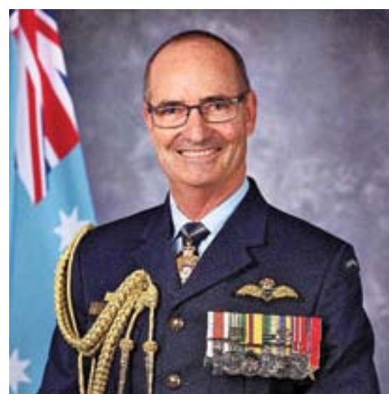
Australian Air Force Commander Mel Hupfeld