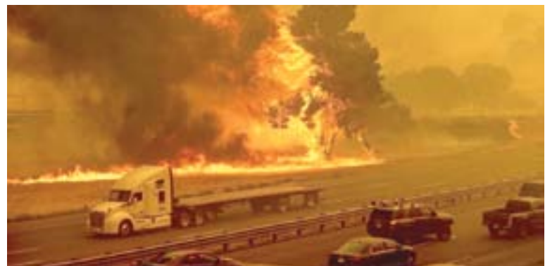
A highway is seen in Sonoma County, California as a series of massive fires in northern and central California forced more evacuations, darkening the skies and dangerously affecting air quality.

In Santa Cruz County, closer to the coast, a series of fires called the CZU Lightning Complex caused extensive damage to California's oldest state park, Big Basin Redwoods State Park, known for its majestic redwoods that are up to 2,000 years old.