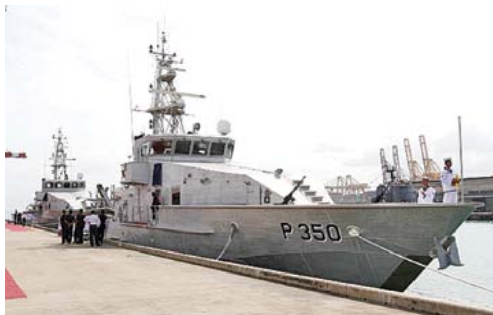
One of the vessels gifted by Australia