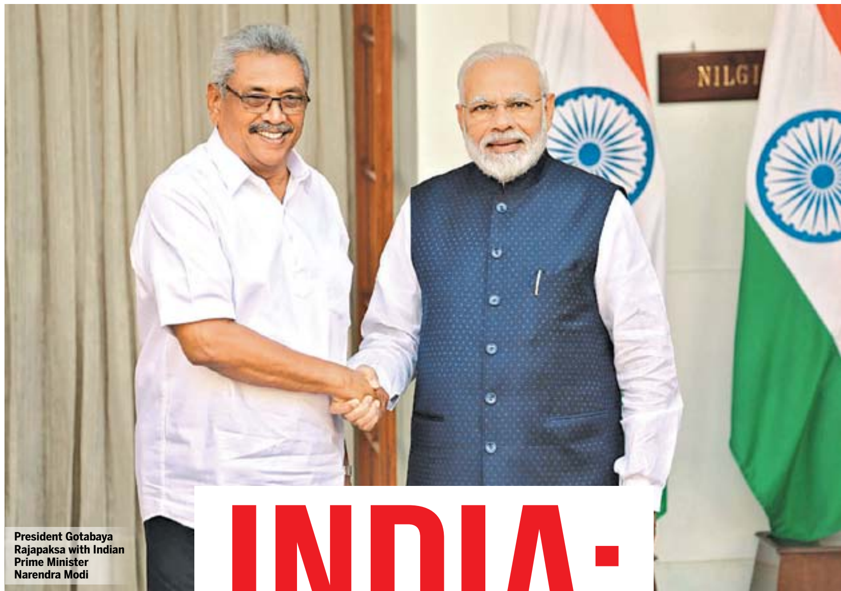
President Gotabaya Rajapaksa with Indian Prime Minister Narendra Modi

Power has only one duty - to secure the social welfare of the People. - Benjamin Disraeli