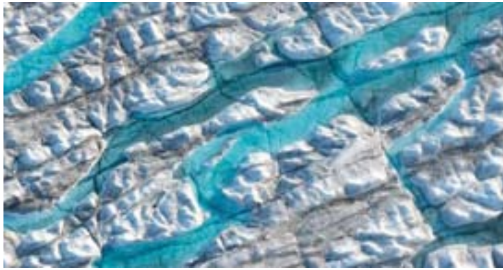
Rivers of meltwater carve the Greenland ice sheet on August 4, 2020.

Crumbling glaciers and torrents of meltwater slicing through Greenland's two-to-three-kilometre thick ice block were the single biggest source of global sea level rise in 2019, accounted for 40 percent of the total, or 1.5 millimetres, researchers reported in the journal Communications Earth & Environment.