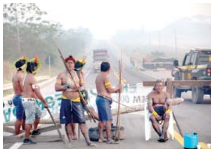
Members of the Kayapo indigenous group block highway BR163 during a protest in the outskirts of Novo Progresso in Para State, Brazil on Thursday. - AFP

"Indigenous health is growing more fragile by the day... We are here to defend the Amazon and protect our territory. But the government wants to open indigenous lands to illegal projects, including mining, logging and ranching." - AFP