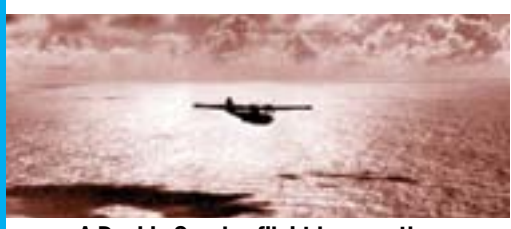
A Double Sunrise flight in operation