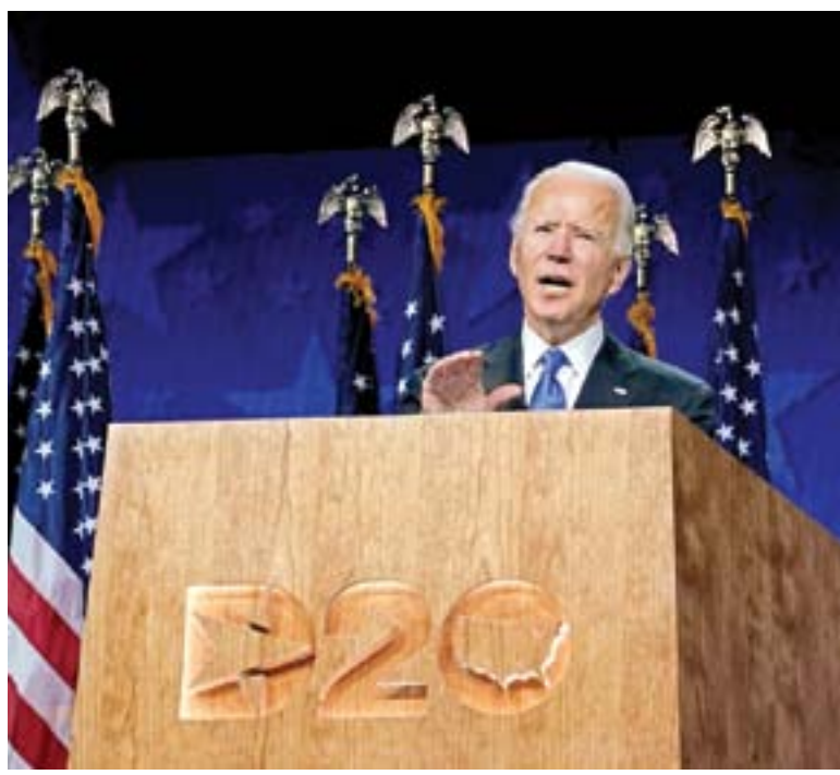
Democratic Presidential candidate Joe Biden.