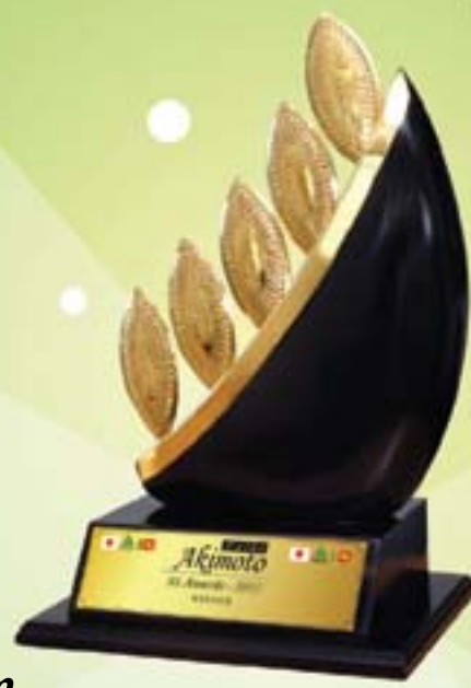
TAIKI AKIMOTO "5S" AWARD

Saturday 22 nd August 2020 at Hotel Galadari - 5.30 pm