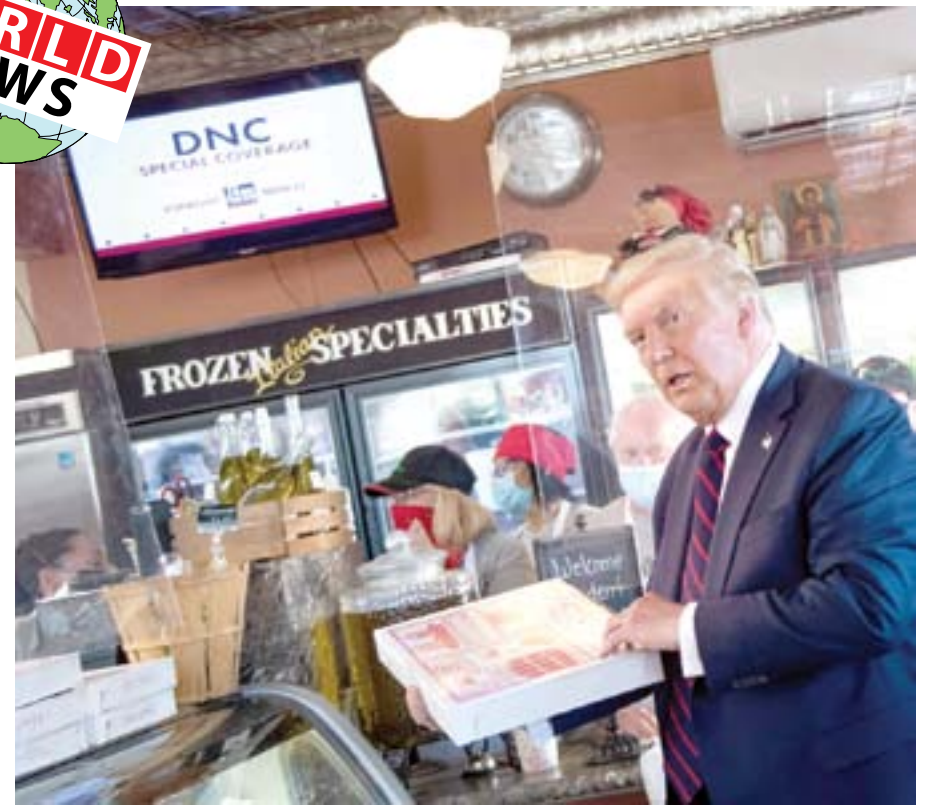
US President Donald Trump stops for a pizza at Arcaro and Genelli in Old Forge, Pennsylvania on his way to a campaign rally on Thursday.