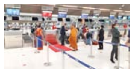
Sri Lankan expatriates at the Suvarnabhumi International Airport in Bangkok.

All the passengers and crew were subjected to Polymerase Chain Reaction (PCR) tests and later sent to quarantine centres.