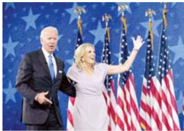
Former Vice-President and Democratic Presidential candidate Joe Biden and wife Jill Biden greet supporters at the Chase Center in Wilmington, Delaware, at the conclusion of the Democratic National Convention on Thursday.

And Biden, 77, urged Americans in blistering terms to punish Trump for the chaos that has seen more