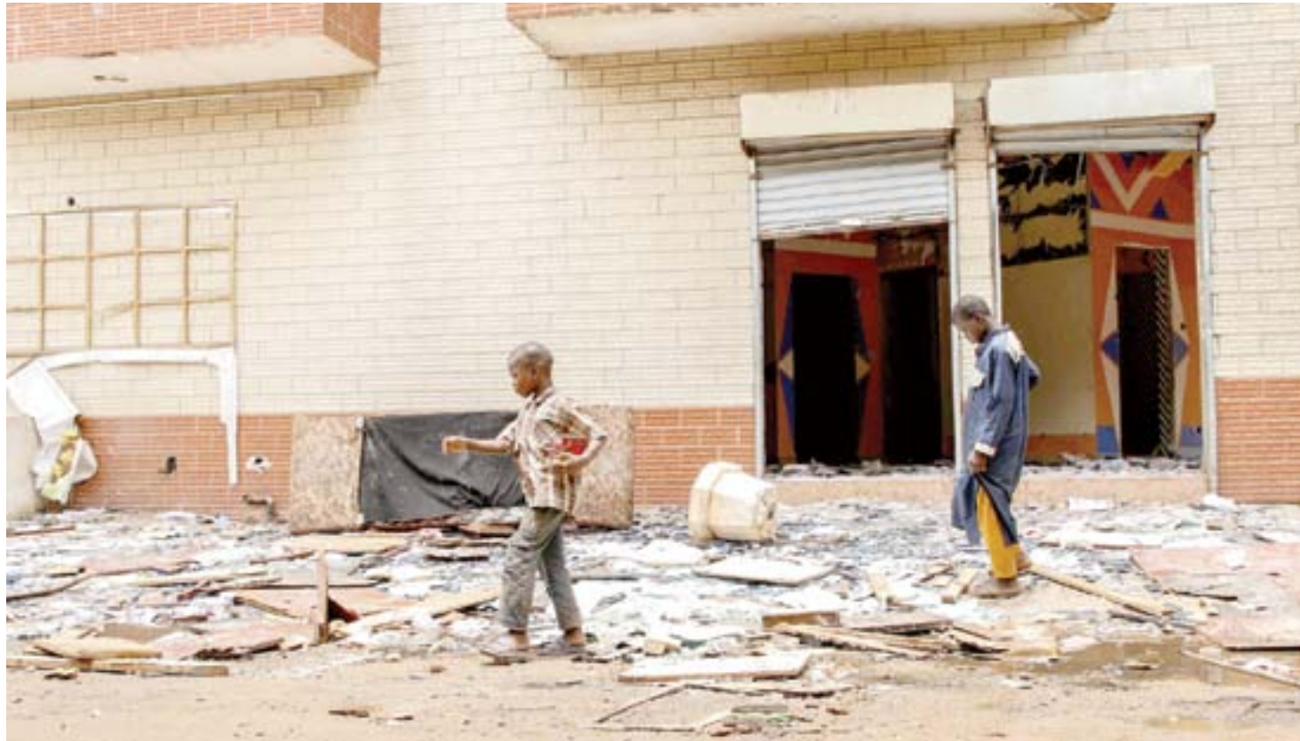
Two boys walk past the damaged building of Mali's Justice and Human Rights Ministry in the Coura district in Bamako. Protesters looted and set on fire to several buildings following the coup in Mali.