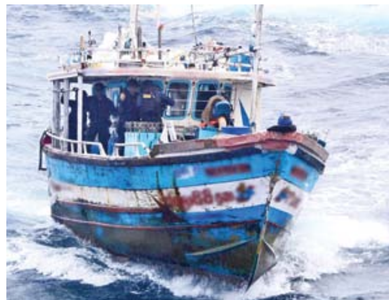
A boat used for people smuggling