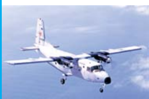
SLAF Y-12 Surveillance Aircraft