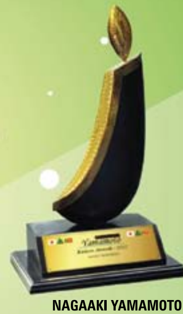
NAGAAKI YAMAMOTO KAIZEN AWARD