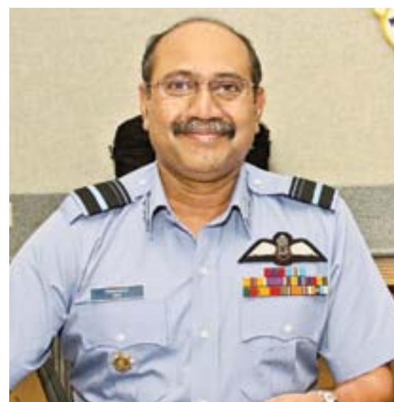
Sri Lanka Air Force Commander Sumangala Dias

nodes of connectivity in neighbouring regions. Sri Lanka is already the most important shipping hub in the Northern Indian Ocean and by virtue of its geography could easily become a pivotal air hub.