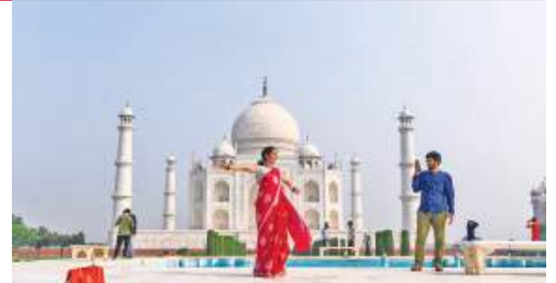
The Taj Mahal reopened to visitors on September 21 in a symbolic business-as-usual gesture even as India and the rest of the world grapples with the COVID-19 pandemic.

Many experts say that even though India is testing more than a million people per day, this is still not enough and the true number of cases may be much higher