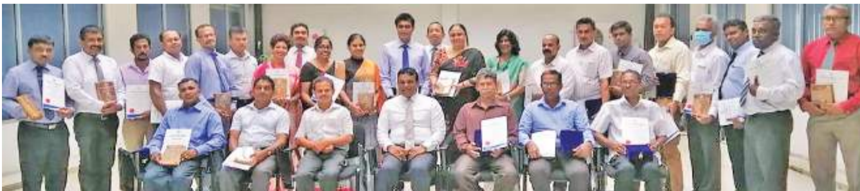
Long Service Award Winners 2020 with the Chairman and CEO of Litro Gas Lanka and Litro Gas Terminal Lanka

Litro Gas has developed a unique legacy that combines the efficiency and tradition of a private enterprise with its state owned status.