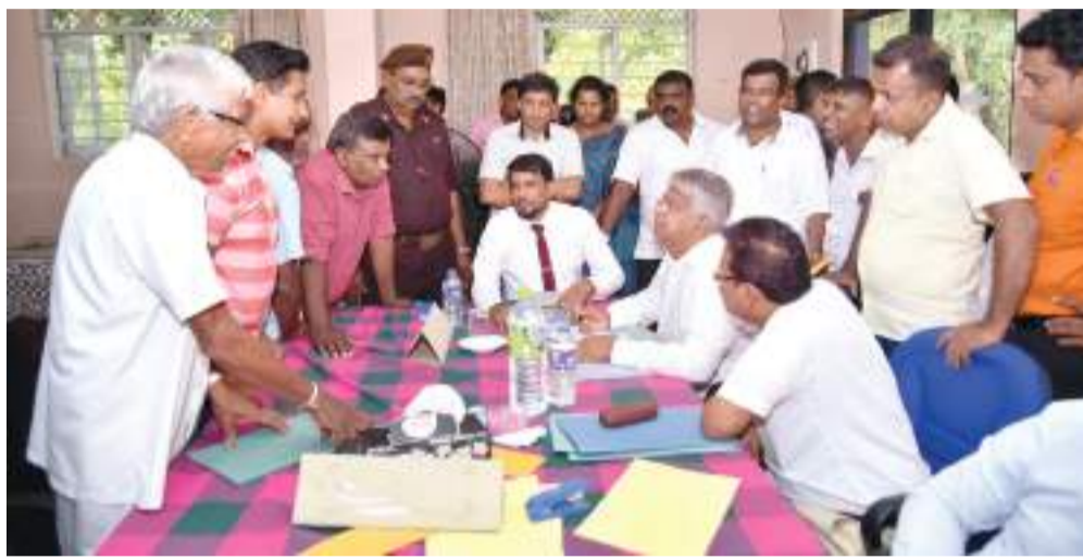
Mahaweli Zones Canals and Settlement Infrastructure State Minister Siripala Gamlath participating in a mobile service for Mahaweli settlers.

State Minister Siripala Gamlath said President Gotabaya