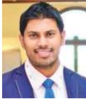
NYSC President Theshara Jayasinghe

The schedule events of the first round at the 32nd National Youth Sports Festival have already commenced but due to Covid 19 pandemic crisis final stage of the sports festival have been postponed to