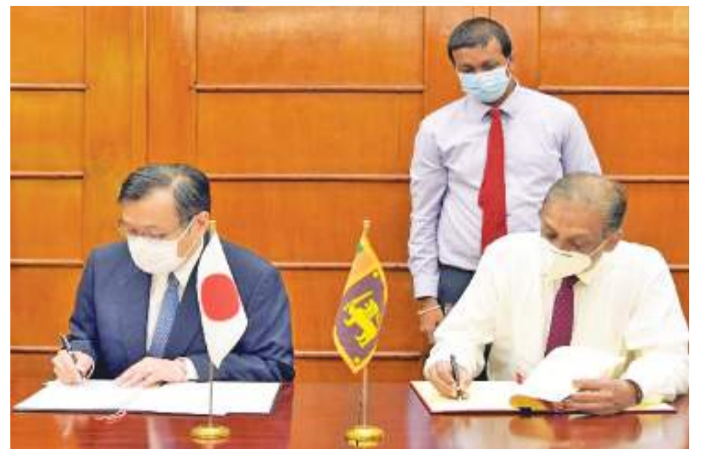
Signing ceremony for Grant Aid for "Economic and Social Development Programme" (Medical equipment - July 8, 2020)

nami of 2011- for one. The assistance of canned fish recently distributed through the World Food Programme (WFP) to the school children is sourced from the areas supported by our friends in the aftermath of the catastrophe, while reflecting ever-lasting thankfulness to the sympathy and kindness expressed by the People and the Gov-