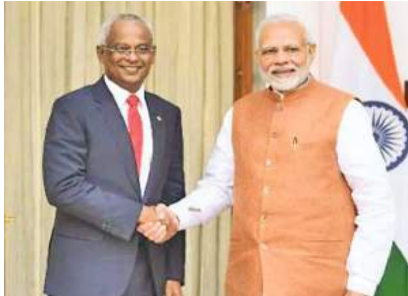
Indian Prime Minister Narendra Modi during an earlier meeting with Maldivian President Ibrahim Mohamed Solih in New Delhi.

The assistance follows a $500 million pledge by New Delhi in August to help build bridges and causeways in the nation of 1,192 islands located on major East-West shipping lanes.