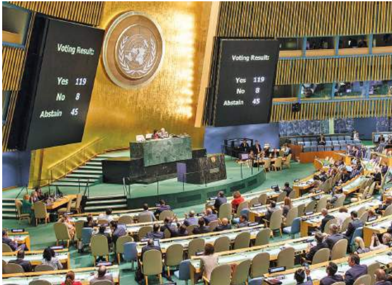
The United Nations General Assembly in New York

Not only Donald Trump, but all state leaders currently need to reassess their position in a world that is now exiting the post-Cold War era.