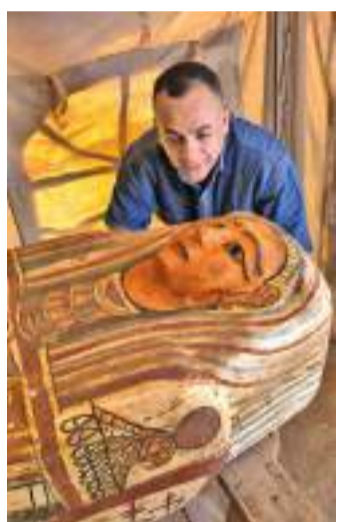
Secretary General of the Supreme Council of Antiquities Mostafa Waziri inspecting one of fourteen 2500 year-old coffins discovered in a burial shaft at the desert necropolis of Saqqara south of the Egyptian capital Cairo. - AFP

The ministry said more excavations had been planned, with the expectation that another trove of wooden coffins would be found at the site. In a video distributed this month announcing the discoveries, Tourism and Antiquities Minister Khaled al-Anani said the recent finds at Saqqara were "just the beginning". Egypt has sought to promote archaeological discoveries across the country in a bid to revive tourism, which took a hit from restrictions on travel due to the novel coronavirus pandemic. In July, authorities reopened the Giza pyramids and other archaeological sites to the public after a three-month closure and waived tourist visa fees to lure holidaymakers. Egypt is also planning to unveil its centrepiece project of the Grand Egyptian Museum in the coming months. - AFP