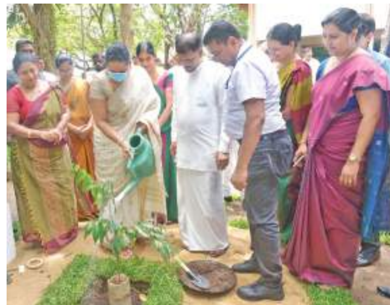
Health Minister Pavithra Wanniarachchi watering a herbal plant while Indigeneous Medicine Promotion, Rural and Ayurvedic Hospitals Development and Community Health State Minister Sisira Jayakody and officials look on.

the current expenditure by 10 percent on the importing of herbs by next year (2021). About 80 percent of herbs imported to Sri Lanka at present can be grown locally, thus saving large sums of money spent on herb imports.