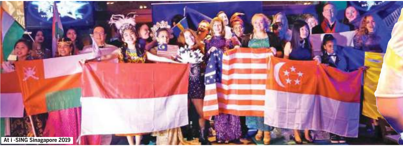
At i-SING Singapore 2019