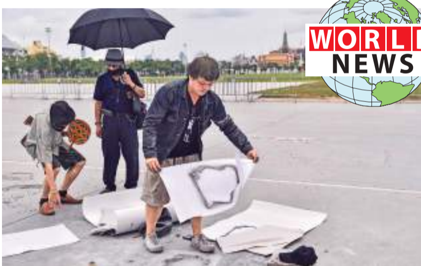
An Art Professor from the Silpakorn University in Thailand makes a stencil over an empty space in Bangkok on September 21, 2020, where a commemorative plaque had been placed by pro-democracy protest leaders on Sunday.