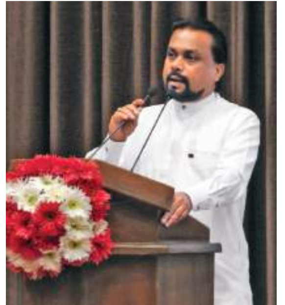
Minister Wimal Weerawansa

While Minister of Mahaweli Development and Irrigation, Chamal Rajapaksa, Minister of Environment, Mahinda Amaraweera, State Minister of Money & Capital Market and State Enterprise Reforms Ajith Nivard Cabraal and State Minister of Aviation Services and Export Zone Development D. V. Chanaka participated as special invitees.