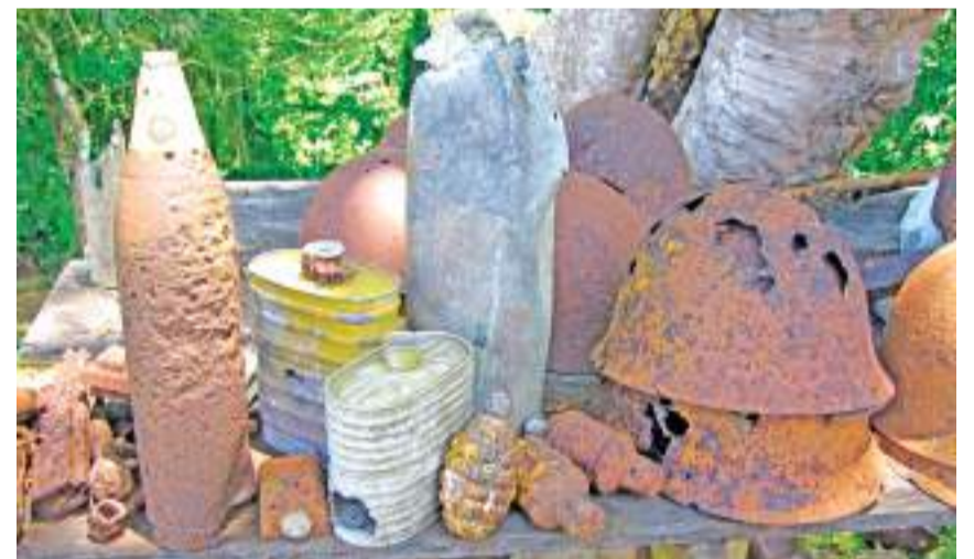
Relics from World War II, including grenades and an artillery shell, on display at Barana Village on the outskirts of Honiara in the Solomon Islands. Two bomb disposal experts from Britain and Australia died in the Solomon Islands when World War II ordnance they were helping to clear exploded on Sunday. - AFP

With just 1C of warming so far, Earth is already battling more frequent and intense wildfires, droughts and super storms rendered more powerful by rising seas. - AFP