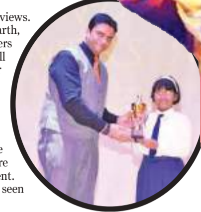
Receiving her award at the Oman Gavel Championship 2019