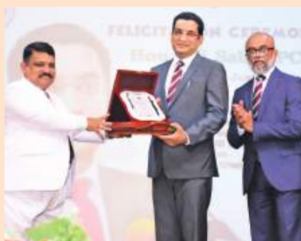
Principal presenting a memento to the Minister