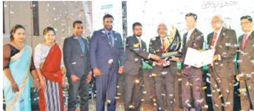
The GPV Lanka team with the award

GPV Lanka (Pvt) Ltd. is a subsidiary of GPV International A/S Denmark. GPV was founded in Denmark in 1961 and is today one of Europe's leading electronics manufacturers. GPV is a global EMS-partner providing complex electronics, cable-harness, mechatronics and box-build