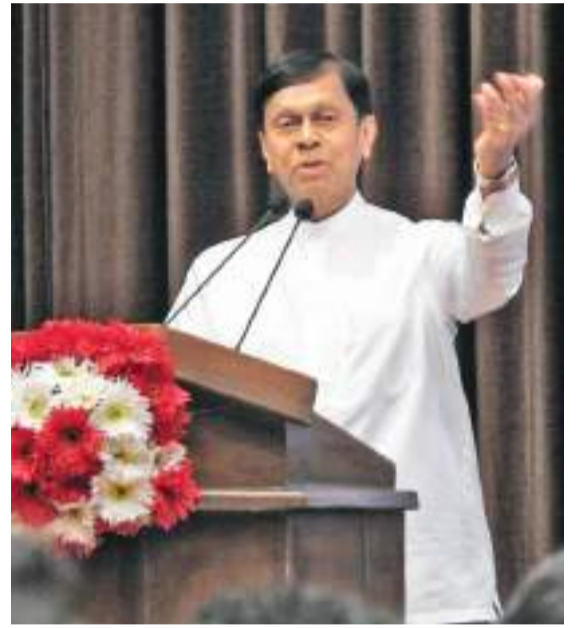
Ajith Nivard Cabraal