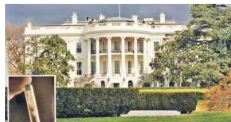
Mail addressed to the White House is first inspected and sorted in depots just outside Washington. (INSET) The small canister which contained the Ricin.