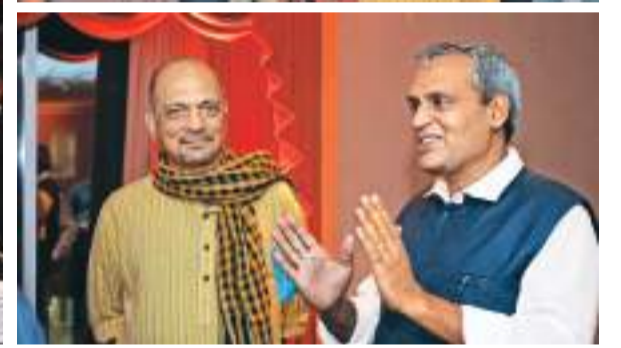
Vignettes of the event