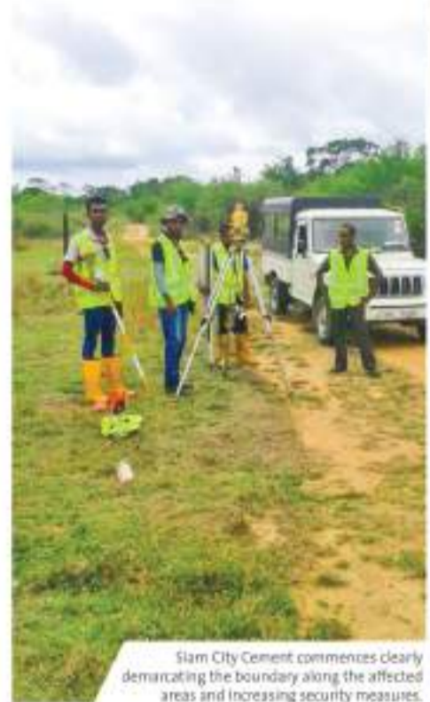
Siam City Cement commences clearly demarcating the boundary along the affected areas and increasing security measures.

With an advancing cement manufacturing operation in Puttalam over the past few decades, SCCL has nurtured strong synergies with the surrounding communities through employment, empowerment, community development and uncountable social projects that have ensured Puttalam's advancement alongside the company. SCCL has also demonstrated a strong commitment to biodiversity management and conservation especially at its quarry sites in concurrent rehabilitation of active quarry site. The company pledges to continue its quarry restoration projects and annual ecological monitoring of restored mines while creating more awareness and educating its communities of the significance of protecting Sri Lanka's ecosystem.