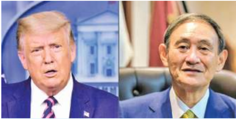
US President Donald Trump and Japanese Prime Minister Yoshihide Suga discussed a "free and open Indo-Pacific" region in a phone call.