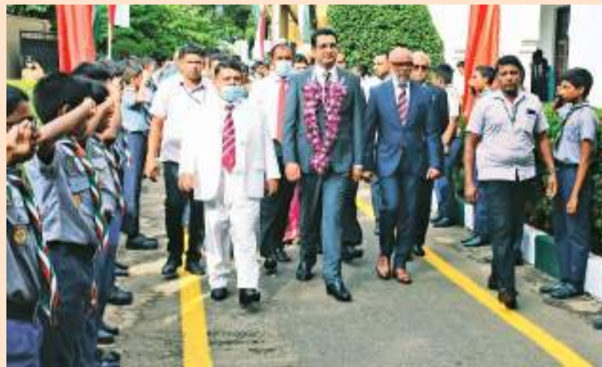
Welcoming the Minister