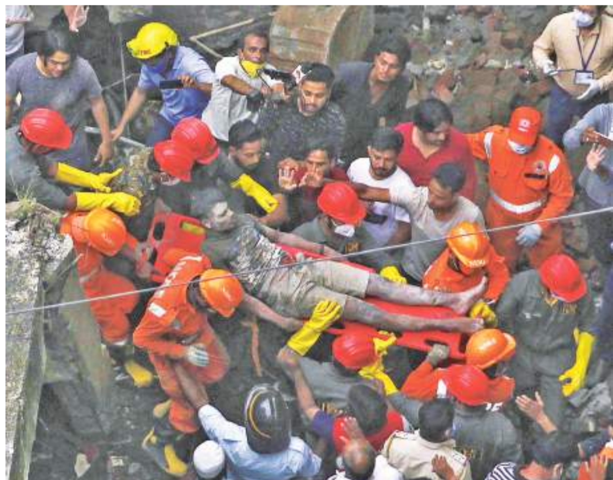
Rescue workers carry a survivor from the rubble of a collapsed three-storey residential building in Bhiwandi on Monday. - AFP

said, adding, "I think it can be done in the future, with other performances like musicals." - AFP