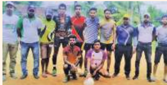
The Champion Vidyarthana Sports Club, Horana volleyball team

ground, Welikala, recently. The runner-up title was won by Ekamuthu Youth Club, Kothalawala. Nine teams participated in the tournament.