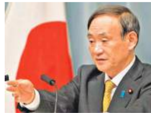
Japanese Prime Minister Yoshihide Suga

Various supports also showcase the token of Japan's deep appreciation in return for the strong solidarity expressed by Sri Lankan friends during the pall of our darkness - the Great East Japan Earthquake and Tsu-