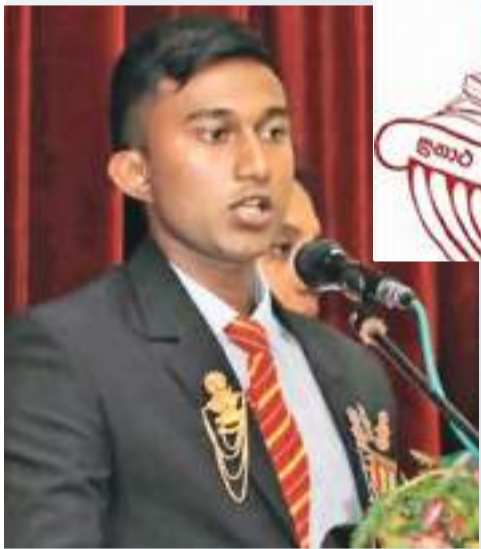
Supun addresses the audience