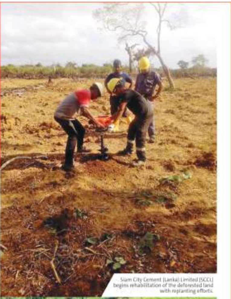
Siam City Cement (Lanka) Limited (SCCL) begins rehabilitation of the deforested land with re-planting efforts.