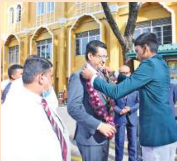
Head Prefect garlands the Minister