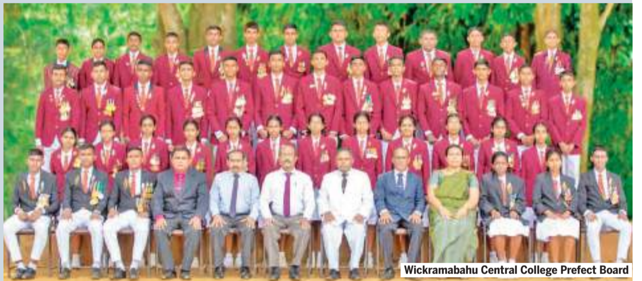
Wickramabahu Central College Prefect Board