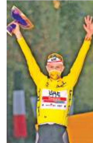
Team UAE Emirates rider Slovenia's Tadej Pogacar wearing the overall leader's yellow jersey celebrates on the podium after winning the 107th edition of the Tour de France cycling race.

Winners of the past five editions, Britain's Team Ineos also had a Tour they may regret. They put their faith in defending champion Egan Bernal, but in spite of spending a week in the white jersey, he struggled to impose himself, lacking perhaps the wisdom and experience of Geraint Thomas or Chris Froome. He lost over seven minutes on stage 15 and dropped out the following day.