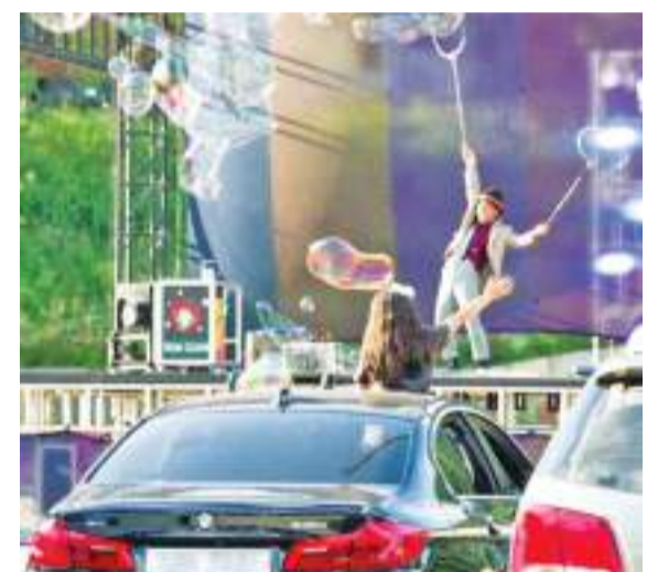
South Koreans watching a circus performance from their cars, at an annual circus that had been turned into a drive-in event in Seoul on Saturday.

"I think watching performances in cars is great," she