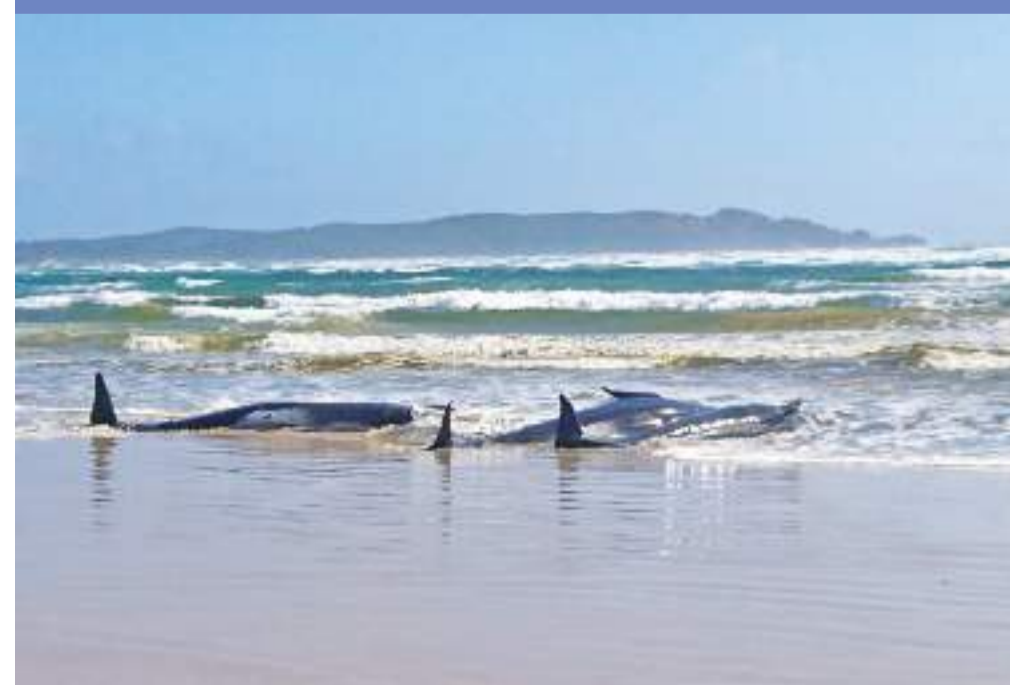
Whales stranded on a sandbar in Macquarie Harbour on the rugged west coast of Tasmania on Sunday.

AUSTRALIA: Over 70 whales are stranded in a bay on the Australian island of Tasmania, officials said Monday, with marine experts now mobilising to see if a rescue is possible.