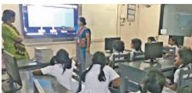
Students continue with digital learning after the end of the lockdown

One of the first schools in the country to adopt the virtual teaching model in the lockdown period to deliver lessons on a regular school timetable, Musaeus College's quantifiable accomplishments include the active involvement of over 300 Primary grades to Advanced Level teachers in the tech-based teaching method, the participation of over 6,000 students