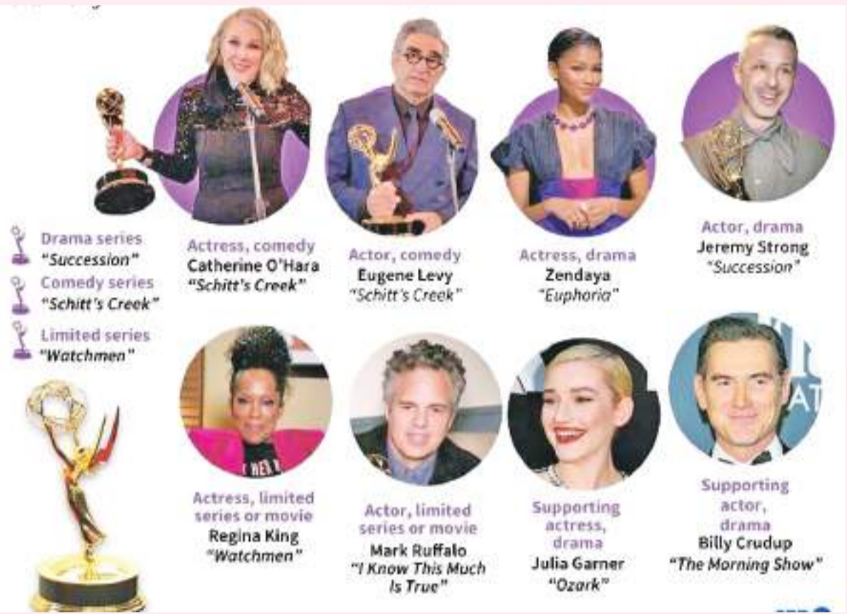
The main winners at the 2020 Emmy Awards