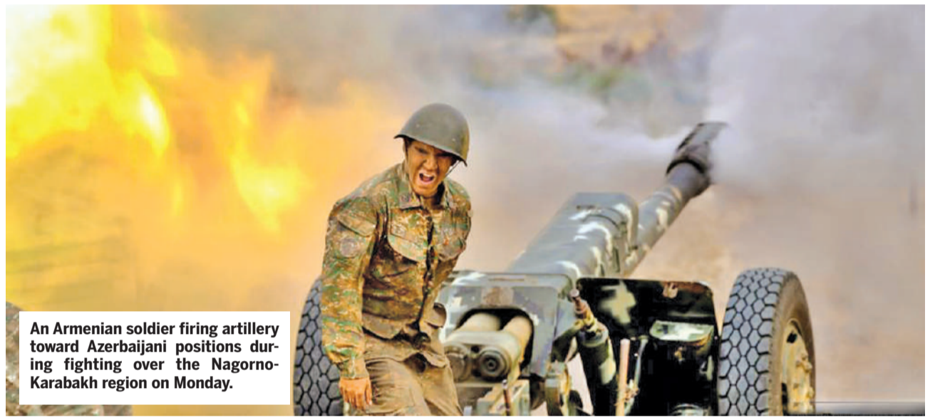
An Armenian soldier firing artillery toward Azerbaijani positions during fighting over the Nagorno-Karabakh region on Monday.

tinuing" on Wednesday, claiming that its forces have killed 2,300 separatist troops since hostilities broke out on Sunday. The ministry said its troops had "destroyed 130 tanks, 200 artillery units, 25 anti-aircraft units, five ammunition depots, 50 anti-tank units, 55 military vehicles" as well as Armenia's Russian-produced S-300 long-range surface-to-air missile system. It said the separatists had "shelled the city of Terter, targeting civilians and civilian infrastructure." Karabakh's defence ministry, on its part, said Azerbaijani forces "continued artillery shelling" of separatist positions along Karabakh's 180-kilometre frontline" on Wednesday morning. - AFP