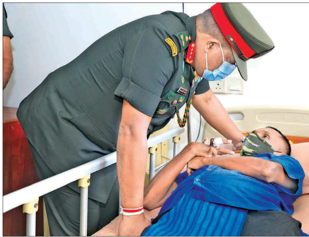
Army Commander Lt. Gen. Shavendra Silva sharing an emotional moment with an incapacitated War Hero during his visit to Abhimansala - 1 in Anuradhapura.