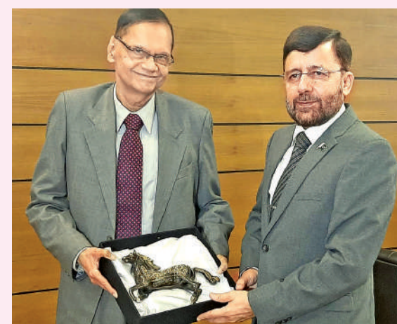
High Commissioner of Pakistan Major General (Retd.) Muhammad Saad Khattak paid a courtesy call on Education Minister Prof. G.L. Peiris on Monday. During the meeting several topics of common interest came under discussion regarding mutual cooperation in the field of education.