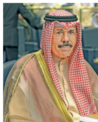
Kuwait's Crown Prince Sheikh Nawaf Al-Ahmad Al-Jaber Al-Sabah.

KUWAIT: Kuwait's Crown Prince Sheikh Nawaf Al Ahmad Al Sabah became the oil-rich nation's new ruling Emir Tuesday night, reaching the highest post in the country after decades in its security services. Sheikh Nawaf, 83, had served as the crown prince since 2006, jumping a traditional order of alternating rule between the Al Jaber and the Al Salim branches of the country's ruling family. While his taking of the throne came as prescribed by Kuwait's constitution,