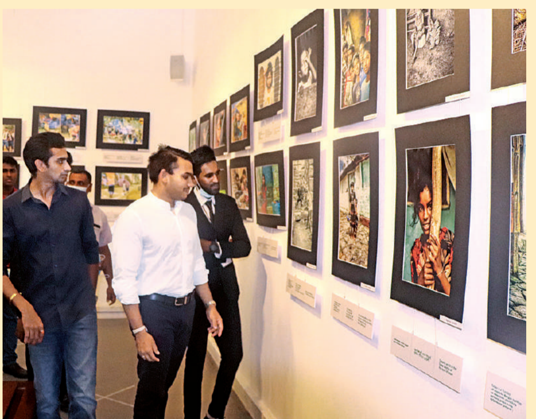
A photographic exhibition under the concept of Tea Liquid arranged by the plantation youth was held in Colombo recently. This exhibition was also held in the Talawakelle, Badulla and Bandarawela areas. Sports Minister Namal Rajapaksa was the Chief Guest at the exhibition on the invitation of Ceylon Workers' Congress General Secretary and State Minister of Estate Housing and Community Infrastructure Jeevan Thondaman. Minister Rajapaksa thanked the students who participated in this exhibition and promised to look into their requirements.

To address these issues, the reconstruction of the KV line has commenced, particularly to convert the existing single line to a double line and install signaling and electrification systems. Therefore, this task would necessitate the resettlement of communities occupying the land required for the expansion of the railway line.