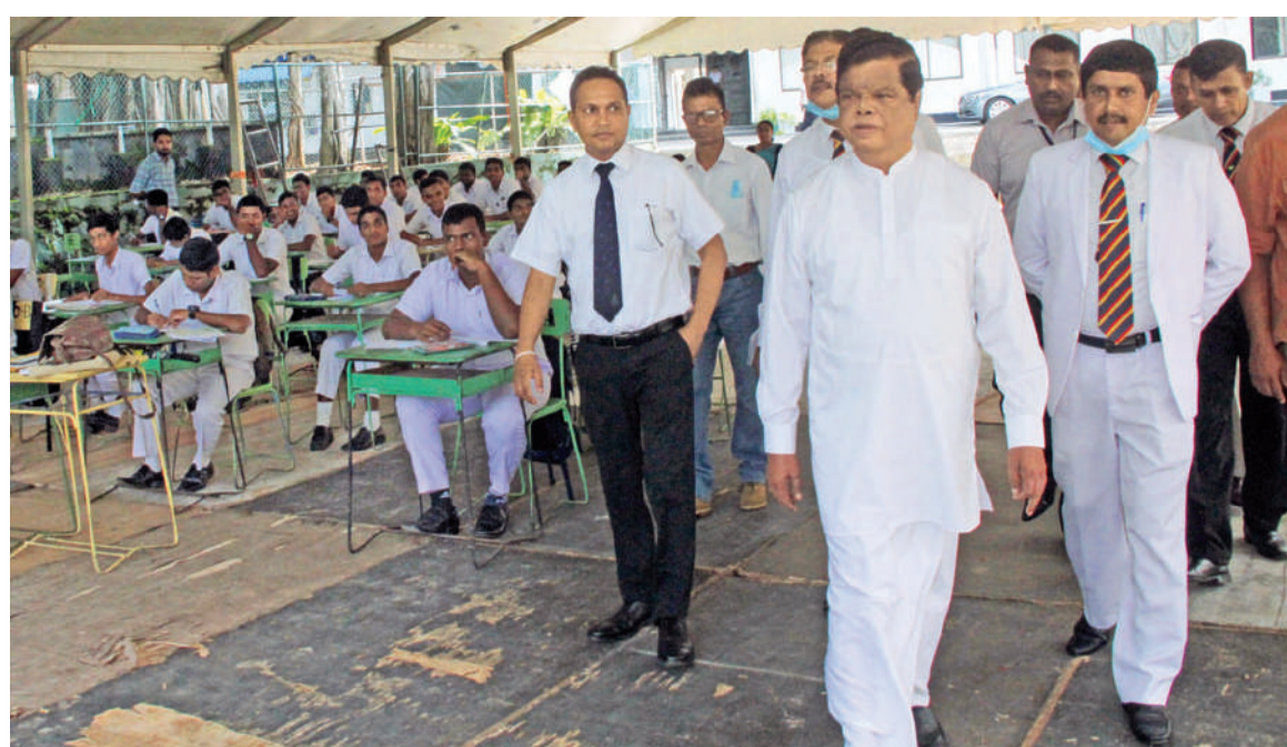
Trade Minister Dr. Bandula Gunawardena made a sudden visit to the Thurstan College, Colombo yesterday (30) following the collapse of a section of a two storied building that was constructed with Mahapola Funds. The students who were studying in the damaged building are temporarily studying in tents. The Minister promised to construct a new building.