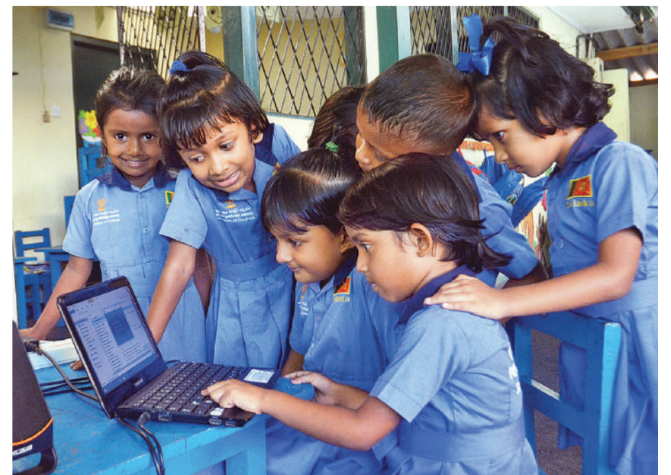
Children of the "Guna Jaya Sathuta Foundation" at Seenigama, Hikkaduwa engaged in drawing pictures using computer technology to mark World Children's Day which falls today (October 1).

to deforestation of thousands of acres during the construction of the Moragahakanda/Kaluganga Reservoirs and villages under these reservoirs, which has led to loss of water resources and caused environmental problems. ▶ TO PAGE 02