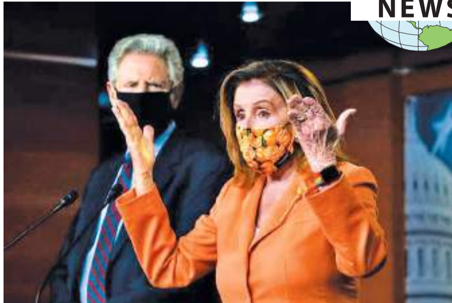
US House Speaker Nancy Pelosi speaking at a press conference on Thursday.

US: US President Donald Trump on Thursday pulled out of next week's Presidential debate after organizers decided to go virtual due to his bout with COVID-19, throwing the US election into new turmoil with only 26 days to go.