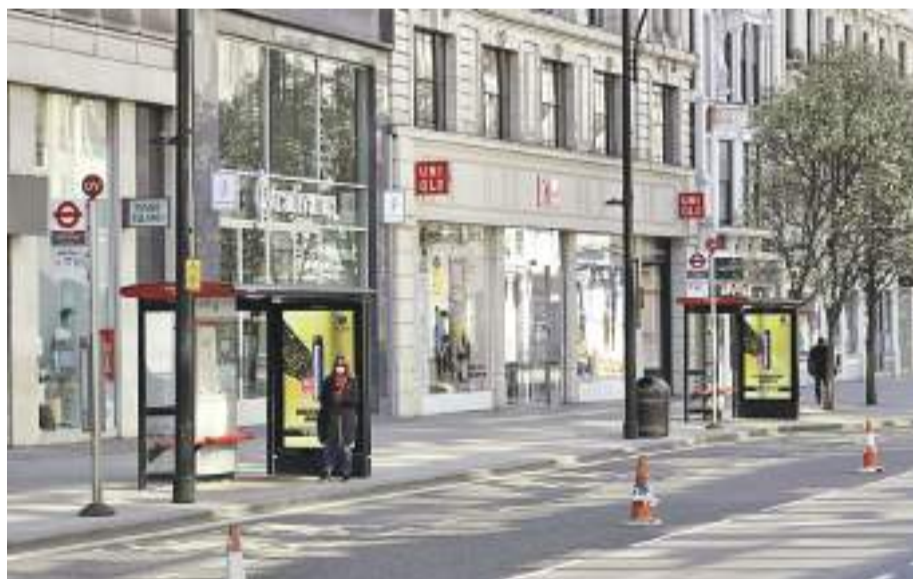
A woman waits for a bus on a deserted Oxford Street in London during the lockdown.

UK: The squeeze on Britain's beleaguered retail sector from tighter coronavirus restrictions reducing numbers of shoppers on the high street clung on into September, data showed Friday.