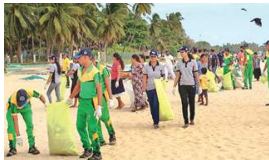
A beach clean-up programme