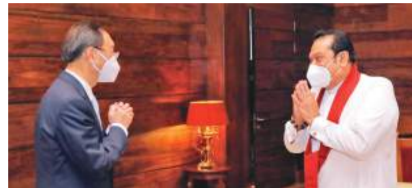
Former Chinese Foreign Minister and the current Communist Party Political Bureau Member Yang Jiechi paying a courtesy call on Prime Minister Mahinda Rajapaksa in Colombo yesterday.

a visiting high level Chinese delegation yesterday. A high level Chinese delegation led by former Chinese Foreign Minister and current member of the Communist Party Political Bureau Yang Jiechi called on Prime Minister Mahinda Rajapaksa at Temple Trees yesterday. ▶ TO PAGE 02