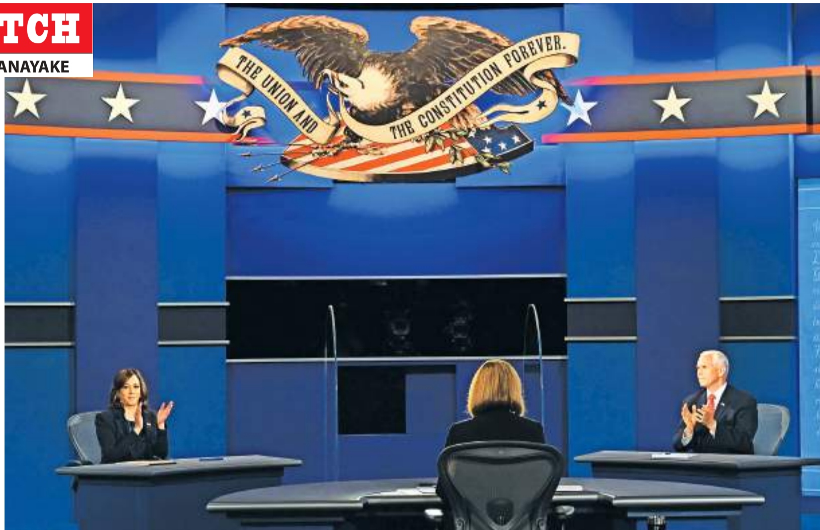
US Democratic Vice Presidential candidate Kamala Harris (L) and US Vice President Mike Pence applaud at the end of the Vice Presidential debate at the University of Utah in Salt Lake City on October 7, 2020.