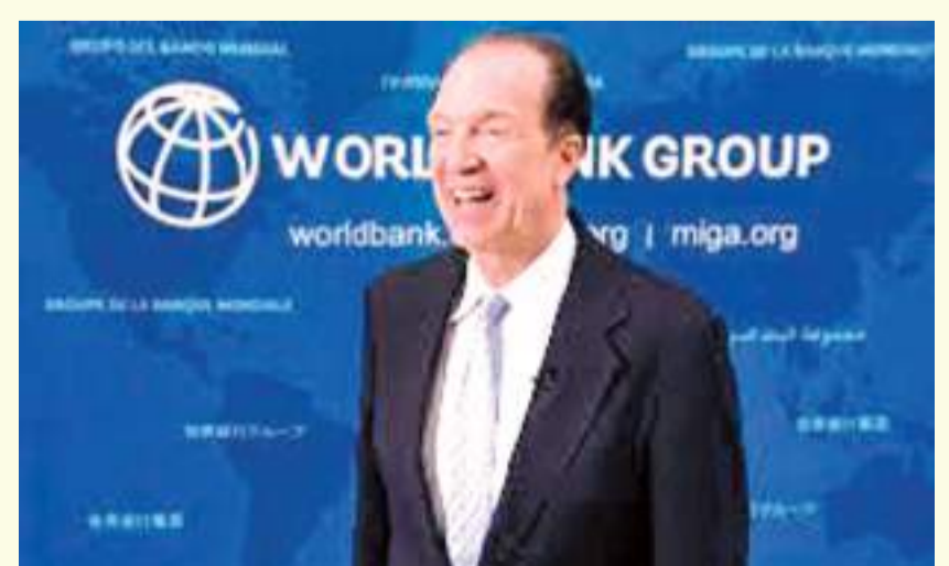
World Bank Group President David Malpass

While less than a tenth of the world's population lives on less than $1.90 a day, close to a quarter of the world's population lives below the $3.20 line and more than 40% of the world's population – almost 3.3 billion people – live below the $5.50 line.