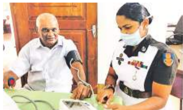
Caring for elders

The Army rose to the occasion and shouldered this vital responsibility which other Armies in the South Asian Region have not done in this magnitude. In the past few months, soldiers engaged in operations with the police to eradicate dangerous narcotics. The Sri Lanka Army has confronted trials and triumphs. They will continue to play an important role as defenders of our resplendent nation.