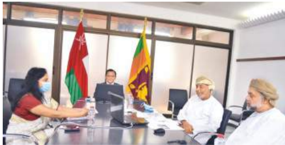
During the B2B meeting.