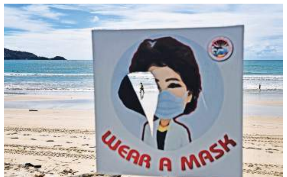
A man walks along an empty Patong beach in Thailand's Phuket which has seen a lack of tourists due to ongoing restrictions relating to the COVID-19 novel coronavirus.

ket. "We will have to focus on developing local customers and individual travellers rather than mass tourism," says Preechawut Keesin.