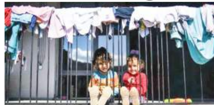
These two children put on a brave face in spite of the heavy fighting between the Armenian and Azerbaijani forces over the disputed Nagorno-Karabakh region.