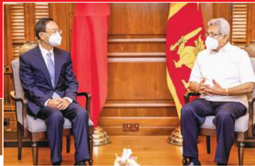
A high-powered Chinese delegation led by former Chinese Foreign Minister and the current Communist Party Political Bureau Member Yang Jiechi met President Gotabaya Rajapaksa yesterday.