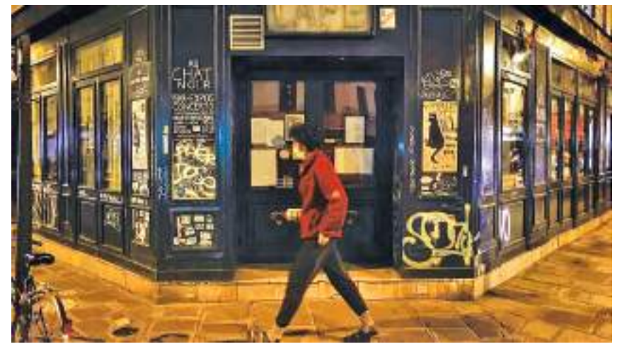
Across Europe, bars and restaurants are being forced to shut their doors again to fight the virus - AFP

Tens of millions of people returned to work on Friday after a long "Golden Week" domestic holiday seen as a test of consumer confidence, cutting a stark contrast to many Western nations afflicted by rolling lockdowns and travel restrictions. - AFP