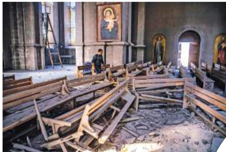
A man walks in rubble inside the Ghazanchetsots (Holy Saviour) Cathedral in the historic city of Shusha in the disputed Nagorno-Karabakh province's capital Stepanakert as fighting between Armenian and Azerbaijani forces intensify.

stone-throwing, tear gas and water cannon - one that left the revolutionary-inclined former Soviet republic without any clear political leadership.