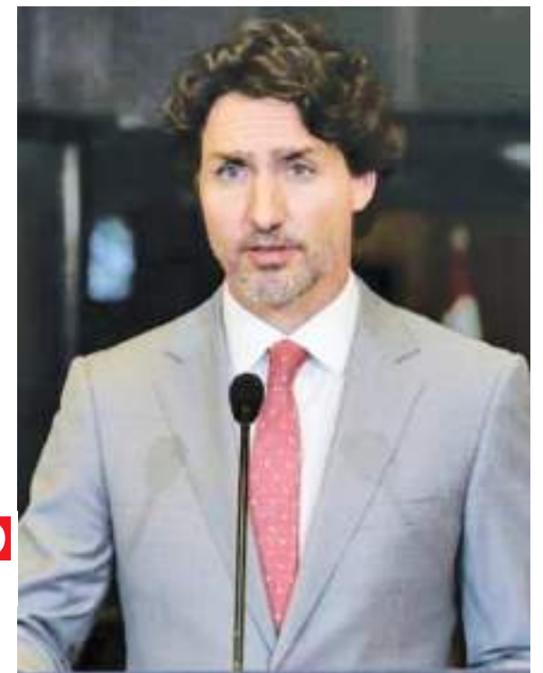
Canadian Prime Minister Justin Trudeau says Ottawa is preparing for "any outcomes" of the US Presidential election.

On Wednesday night, Harris debated with Vice President Mike Pence and spent much of her time hammering Trump for "the greatest failure of any Presidential administration in the history of our country" over COVID-19.