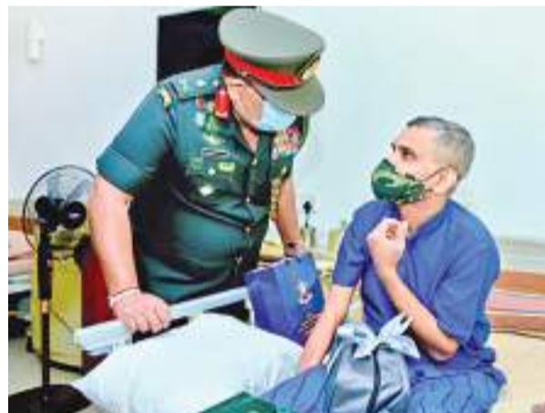
Army Commander Lieutenant General Shavendra Silva with a War Hero

tions. The SF Regiment is also empowered with Anti-Hijack Units. In the final stages of the humanitarian operations in 2009, the Infantry Regiments, Special Forces, Armoured Corps, Air Mobile Brigade, Artillery and Mechanized Infantry Units collectively contributed to the war effort. Hundreds of officers and soldiers laid down their lives in the line of duty. Many young men remain disabled and dependent for life. In this backdrop of sacrifice, it is of paramount importance that all politicians and stakeholders in governance sustain this hard-won peace, and work towards embracing our diversity whereby we create a bountiful nation for all Sri Lankans.