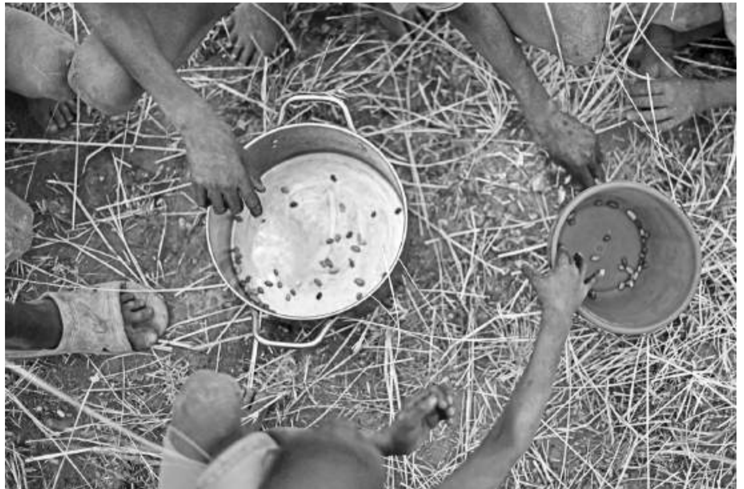
In this file photo taken on February 06, 2020 Children collect grain spilt on the field from gunny bags that ruptured upon ground impact following a food drop from a plane at a village in Ayod county, South Sudan, where World Food Programme (WFP) have just carried out a food drop of grain and supplementary aid.