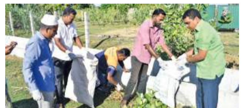
Volunteers cleaning a road.

Volunteers from the Pradeshiya Sabha, Chamber of Tourism Industry of Sri Lanka, Arugam Bay Tourism Association, social welfare associations, women development