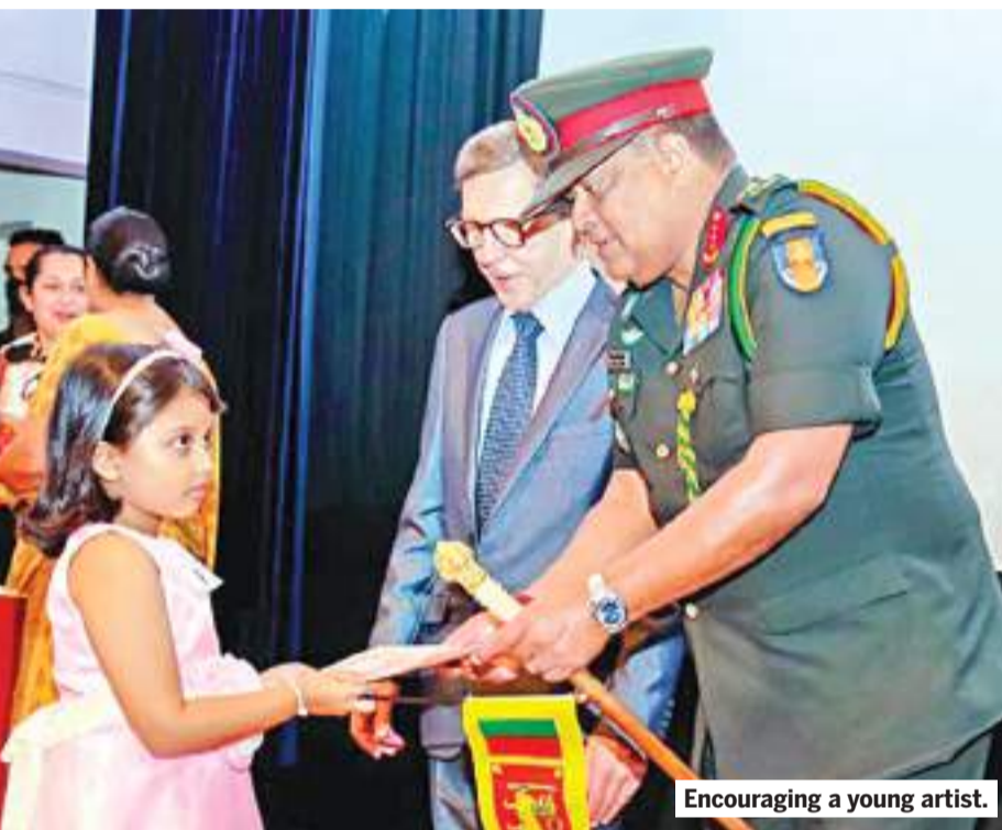
Encouraging a young artist.

During the prolonged 30-year conflict, the Army adopted and adjusted to various levels of threats incorporating technology and enhanced training. The Special Forces (SF) Regiment is another vital component of the military strike capability. These strategic combatants have rendered a great service infiltrating and fighting behind enemy lines. The feared Long Range Reconnaissance Patrol (LRRP) is the apex element of Special Forces covert opera-