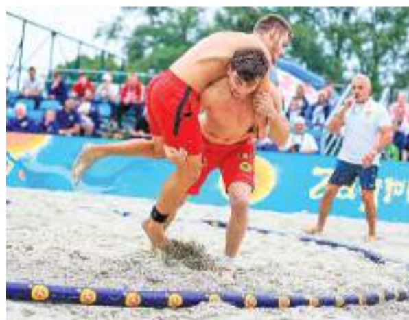
Wrestlers from four Asian countries will participate in this tournament.

When inquired about the status of the Lanka Premier League (LPL), he said, "We have scheduled it for end of next month. There is no change in the dates up to now. Once again, it is too early to make a prediction, but for sure it will also be taken into consideration in the upcoming weeks. If things return to normal, then it will proceed as scheduled."