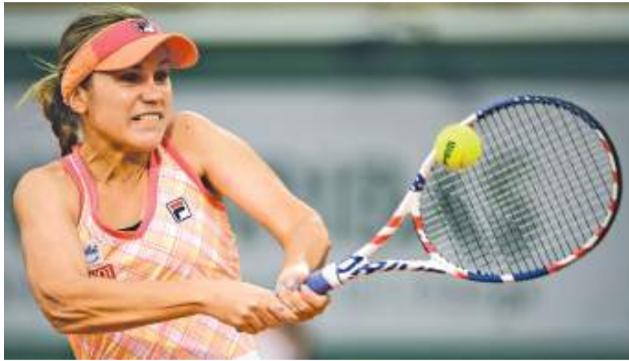
Sofia Kenin of the US returns the ball to Czech Republic's Petra Kvitova during their women's singles semi-final tennis match of The Roland Garros 2020 French Open tennis tournament in Paris on Thursday.

Before this season, Kenin had never gone as far as the quarter-finals on clay. She