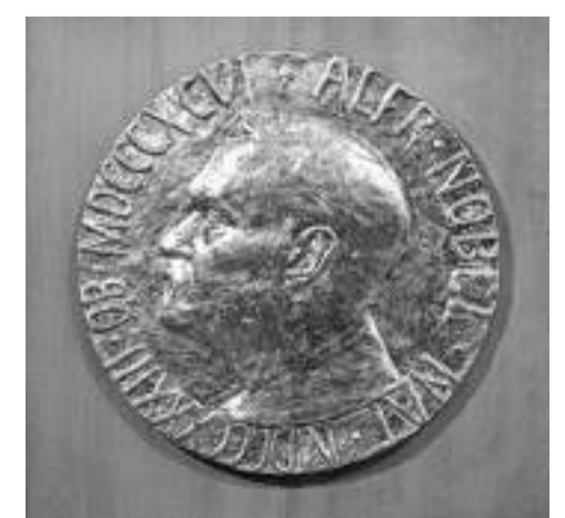
The portrait of Alfred Nobel is seen at the desk prior to the announcement of the laureates of the 2020 Nobel Peace Prize in the Nobel Institute in Oslo on Friday.