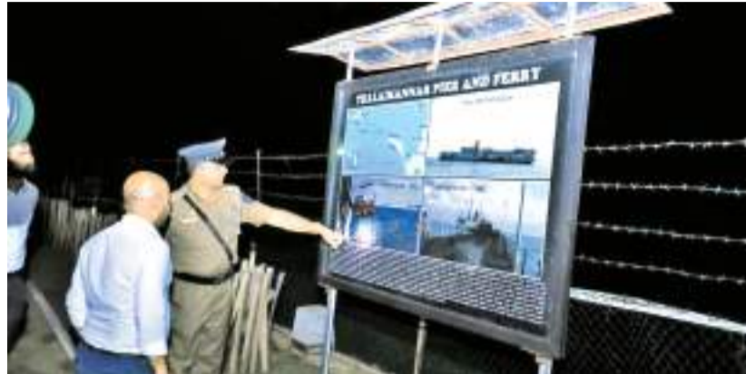
State Minister Duminda Dissanayake during the inspection tour at the Adam's Bridge in Talaimannar.

There had been discussions between the governments of India and Sri Lanka with regard to the generation and supply of electricity.