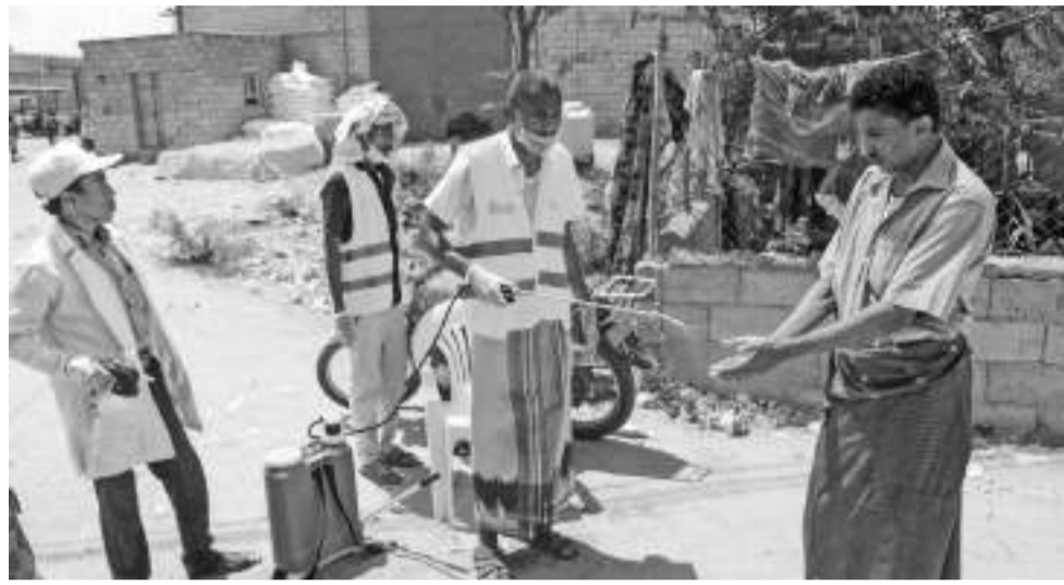
World Food Programme (WFP) employees spray the hands of a displaced Yemeni man with disinfectant as prevention from the COVID-19 novel coronavirus in the capital Sanaa.