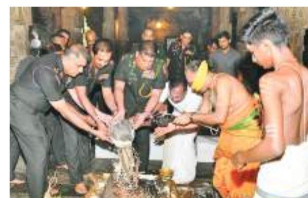
Army officers performing religious rituals at a kovil.