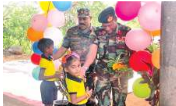
During a school project