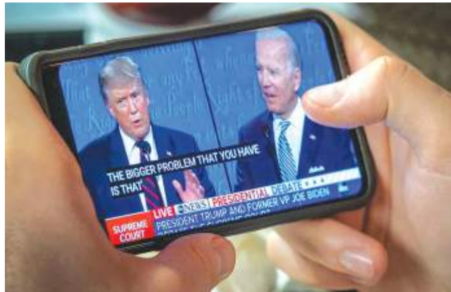
The first Trump-Biden Presidential debate.