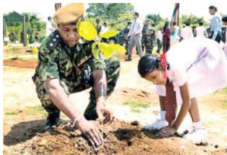
A tree-planting campaign by the Army