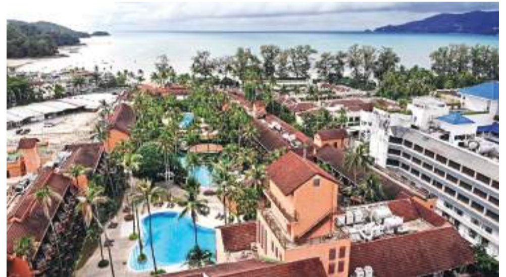
In this aerial file photo taken on October 01, 2020 shows empty swimming pools at a hotel on Patong beach in Phuket.

And the two-week compulsory quarantine and high price tag - several thousand dollars a person - will mean this is a niche mar-