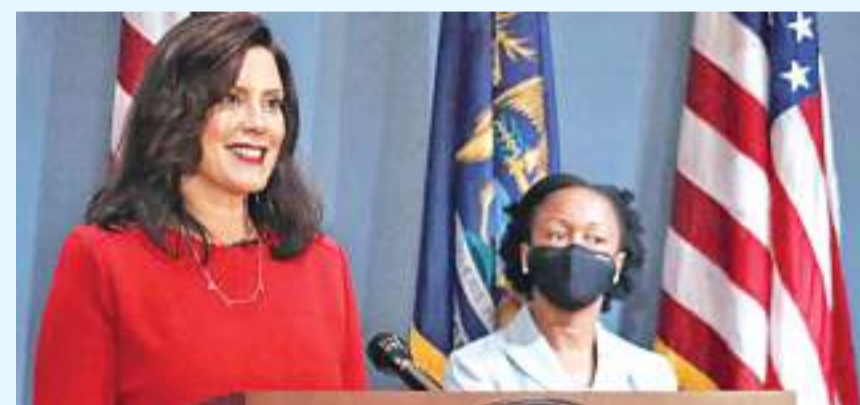
Michigan Governor Gretchen Whitmer (L) addressing a recent press conference.

US: Thirteen men, including members of two right-wing militias, have been arrested for plotting to kidnap the Democratic Governor of the US state of Michigan and "instigate a civil war", officials said Thursday.