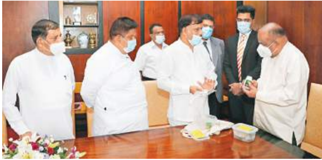
State Minister of Indigenous Medicine Promotion, Rural and Ayurvedic Hospitals Development and Community Health Sisira Jayakody presenting newly-introduced Ayurvedic drugs to Speaker Mahinda Yapa Abeywardena.

State Minister Jayakody further stated that these