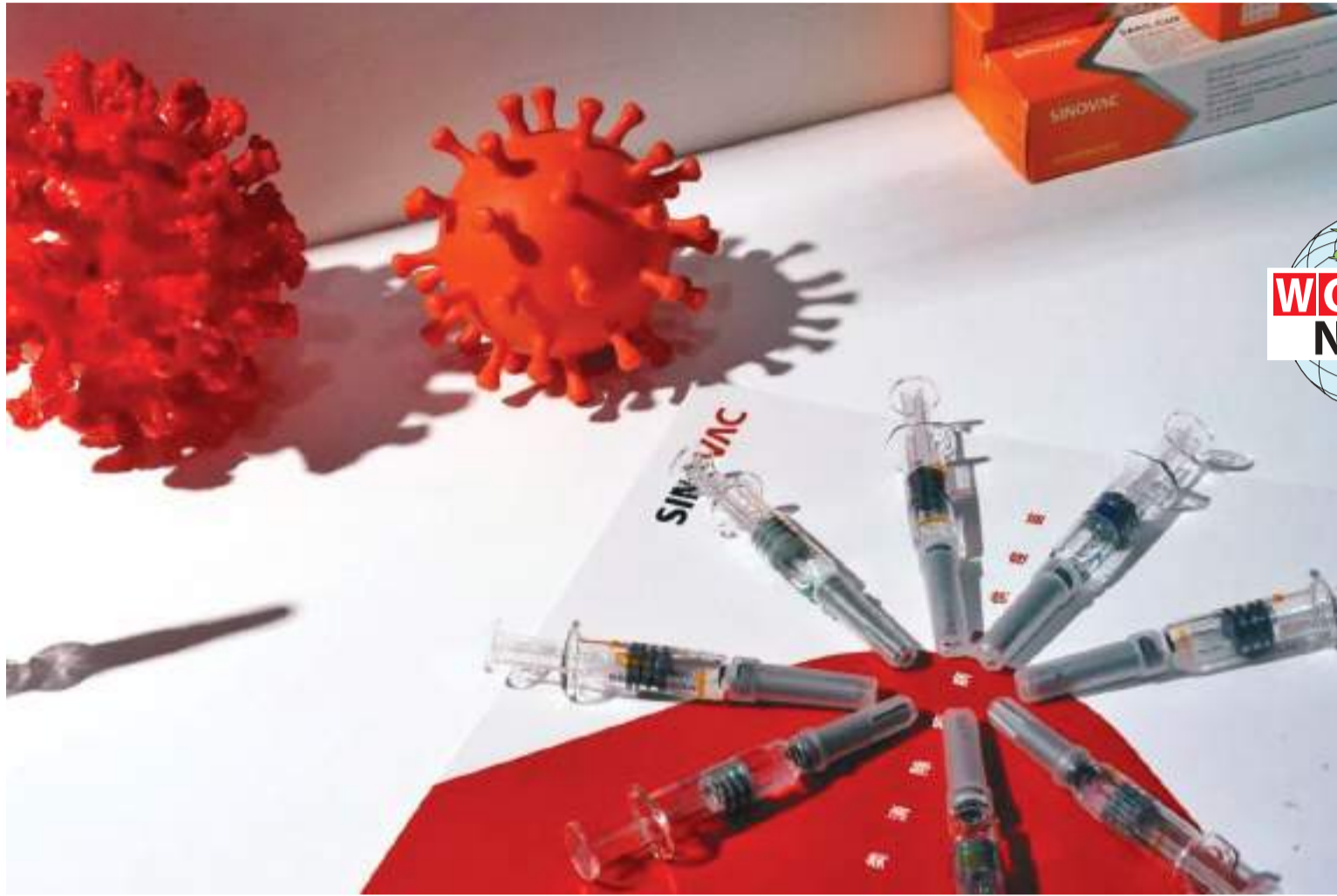
A booth displaying a COVID-19 vaccine candidate is seen at the 2020 China International Fair for Trade in Services, in Beijing on September 4, 2020.

CHINA: China has signed up to a deal to ensure future Covid-19 vaccines are distributed to developing countries, the biggest economy yet to join the World Health Organization-led bid to control the pandemic.