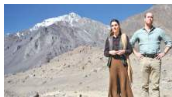
This October 16, 2019 file photo of William and Kate during a Royal tour of the Chiatibo glacier in the Hindu Kush mountain range in Pakistan.

"That ultimately has to change, because I also worry