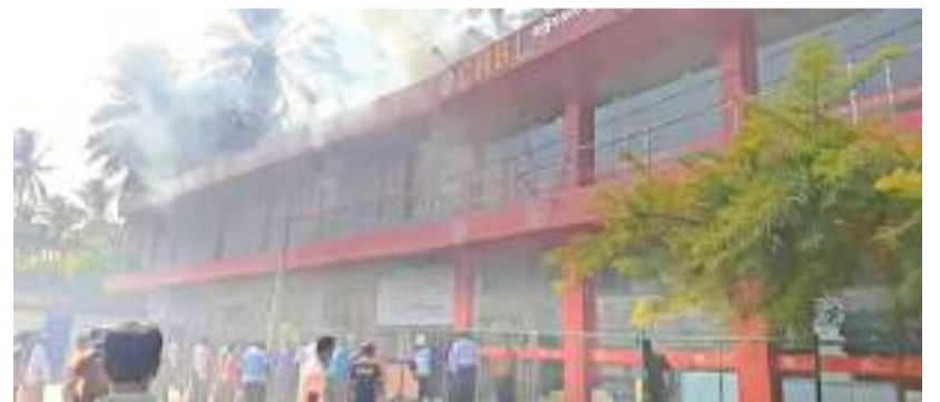
The building which caught fire.

The fire is suspected to have been caused by an electricity leakage. Mahawela Police are conducting investigations.