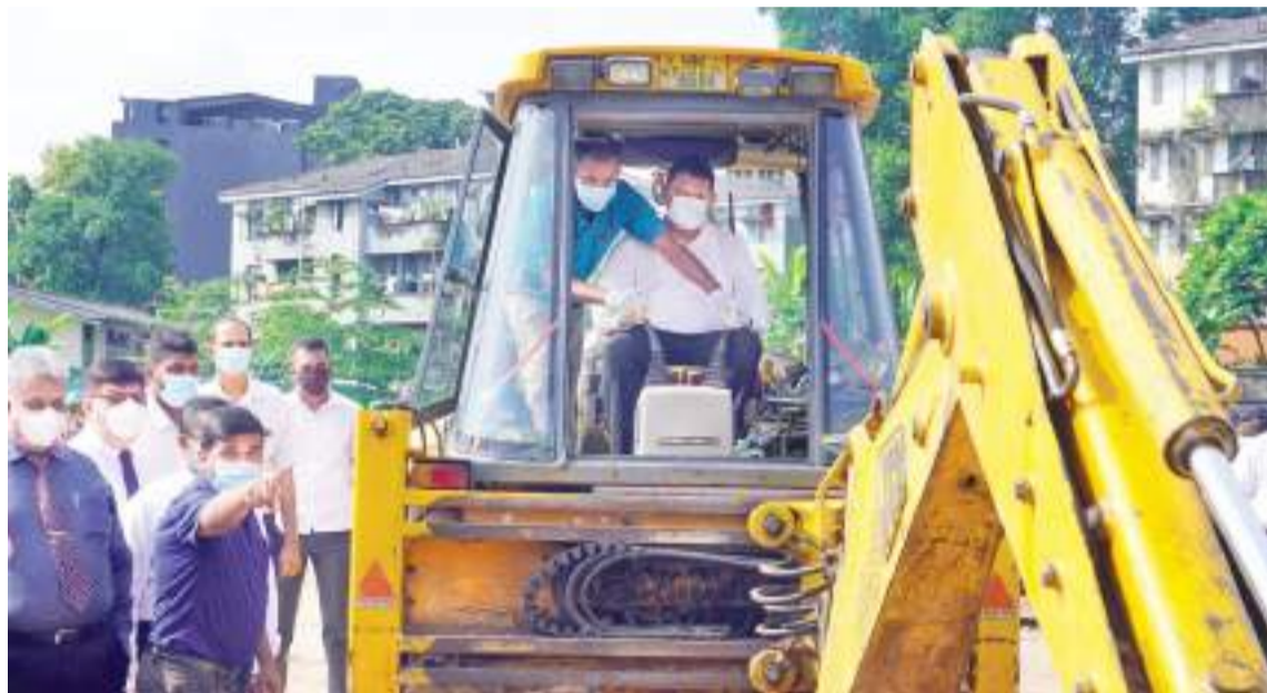
State Minister of Urban Development, Coast Conservation, Waste Disposal and Community Cleanliness Dr. Nalaka Godahewa at the inauguration ceremony to construct 400 housing units at Elliot Place Borella.

"However 60% to 70% of those units are not fully completed. Some families don't have a house at all. It is imperative that we formulate a systematic plan to solve the housing problems of our country. Several previous governments made various attempts to solve urban housing problem. It was President Gotabaya Rajapaksa who devised the most effective solution for this problem during