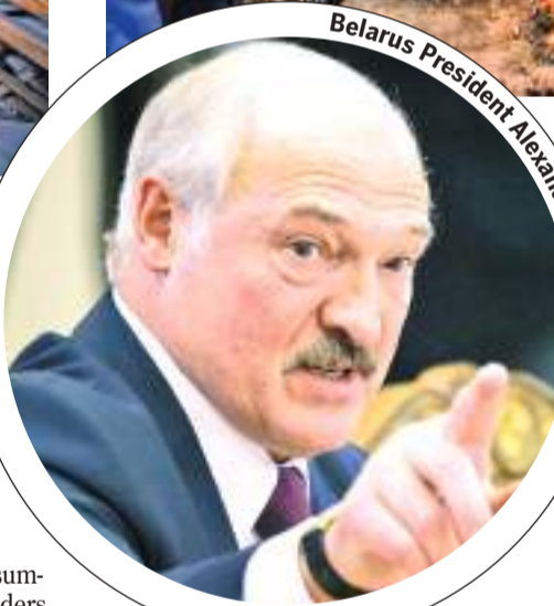
Belarus President Alexander Lukashenko

rus officials, but not Mr. Lukashenko himself.