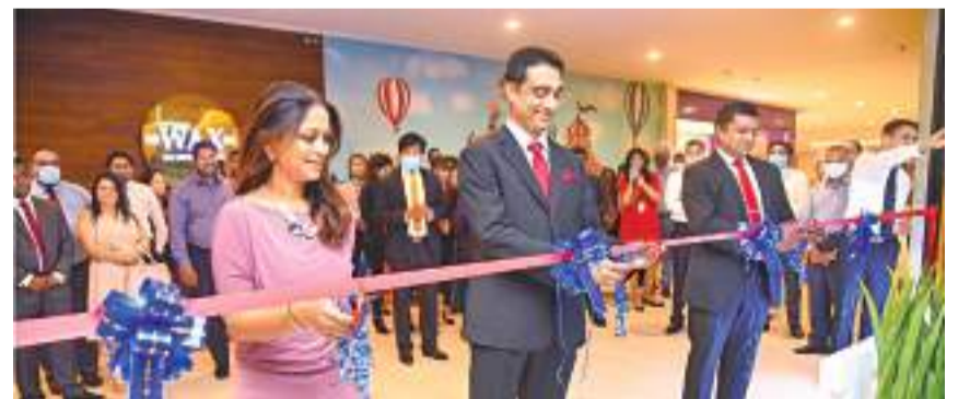
The opening of the Premier Learning Centre at One Galle Face.

Located at the One Galle Face Mall, the Premier Learning Centre features a luxurious atmosphere, and gives access to world class trainers and mentors in a wide range of areas and expertise. ESOFT is unique in being the first educational establishment to be located at One Galle Face. The mix of retail shops, service providers, cafes and restaurants, the cinema, and the apartment and hotel complex draws in a unique cus-