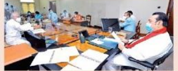
Prime Minister Mahinda Rajapaksa chairing the meeting.

A meeting of the CCF Board was held yesterday (29) at Temple Trees under the patronage of Prime Minister Mahinda Rajapaksa who is also the Buddha Sasana Religious and Cultural Affairs Minister.