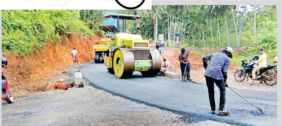
The rehabilitation of the Neluwa-Lankagama road, which has been a long-standing need for the people in the isolated village of Lankagama in the Sinharaja Forest range, is in its final lap. The road will be completed within 90 days under President Gotabaya Rajapaksa's directive. President Rajapaksa reiterated his intention to fulfill the needs of the people without harming the environment when he visited the village late August. Hence, 2,100 new saplings will be added to the reserve following the opening of the new road that will also replace a rickety hanging-bridge with a permanent one. More pictures on page 12.

QUARANTINE FOR THOSE WHO LEFT WP AHEAD OF CURFEW