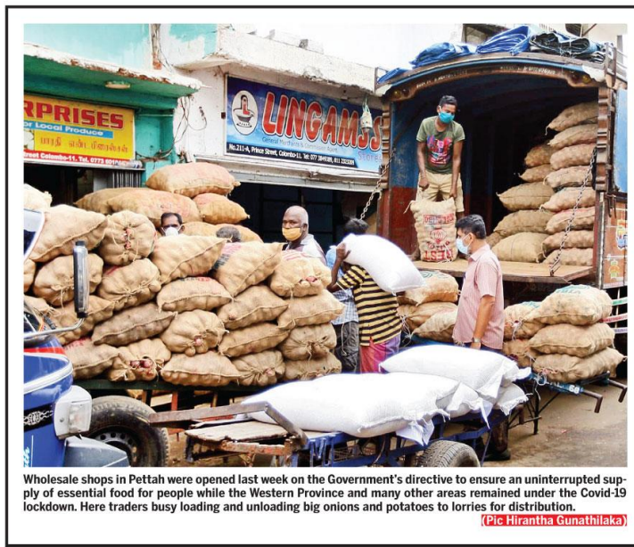
Wholesale shops in Pettah were opened last week on the Government's directive to ensure an uninterrupted supply of essential food for people while the Western Province and many other areas remained under the Covid-19 lockdown. Here traders busy loading and unloading big onions and potatoes to lorries for distribution.

A Biden win would see Trump leave office in January after four years. SEE PAGE 2