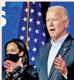
President-elect Joe Biden with VP Elect Kamala Harris.

"I sought this office to rebuild the soul of America, to rebuild the backbone of this nation, the middle class and to make America respected around the world again," Biden said. Vice President-elect Kamala Harris introduced her running mate,