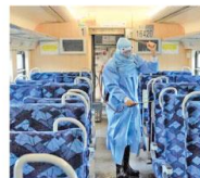
of the quarantine curfew from today.

Vehicle Regulation, Bus Transport Services, Train Compartment and Motor Car Industry State Minister Dilum Amunugama said this will be enforced in the Western Province with the lifting