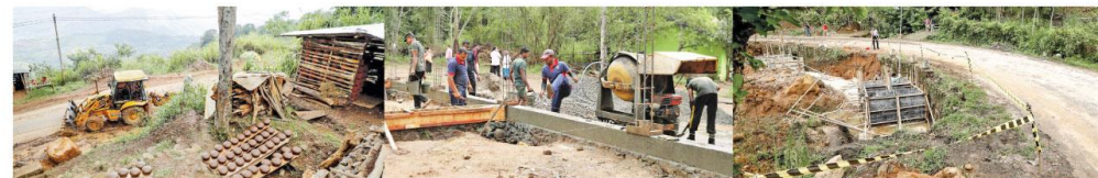
Development work in the Haldummulla area is continuing at a pace after President Gotabaya Rajapaksa's visit to the area a few months back where the President was privy to first hand information on the needs of the villagers in this area.

had embarked on an inspection tour of these two villages Velanvita and Akkara Seeya in the Haldummulla area in the Badulla District during his programme "in conversation with a village" on September 25.