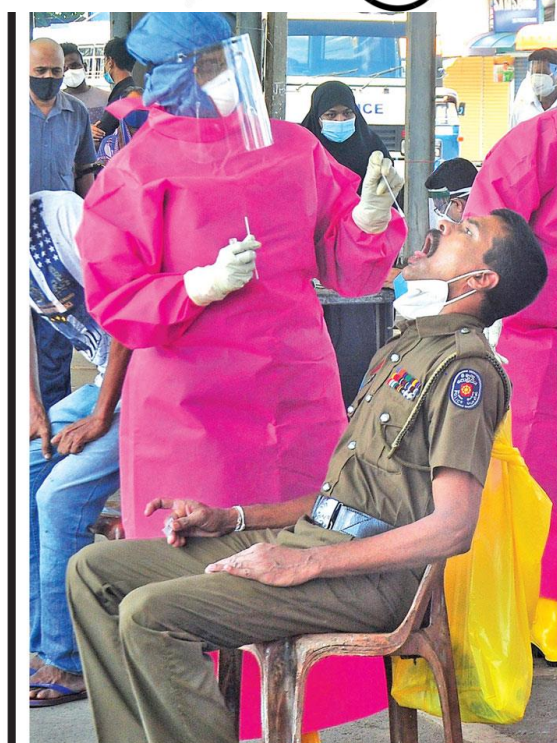
In the wake of the increasing number of COVID-19 positive cases in the country, random PCR tests were conducted in many parts of the Colombo and Gampaha districts. Here, a PCR test being conducted on a Policeman in Colombo.