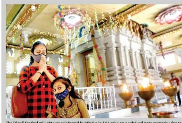
The Diwali Festival of Light was celebrated by Hindus in Sri Lanka on a subdued note yesterday due to the pandemic. Hindu devotees across the country participated in the Diwali message yesterday. SEE PAGE 2

officials to immediately halt the notification of deaths in high-risk areas and release the body only if PCR is performed. SEE PAGE 2