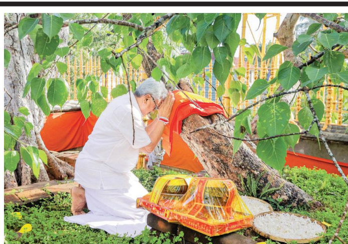
President Gotabaya Rajapaksa participated in religious observances at the Sacred Jaya Sri Maha Bodhiya, Anuradhapura yesterday seeking blessings on the people in Sri Lanka and the world.