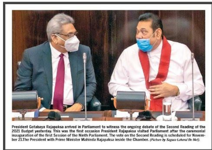
President Gotabaya Rajapaksa arrived in Parliament to witness the ongoing debate of the Second Reading of the 2021 Budget yesterday. This was the first occasion President Rajapaksa visited Parliament after the ceremonial inauguration of the first Session of the Ninth Parliament. The vote on the Second Reading is scheduled for November 21. The President with Prime Minister Mahinda Rajapaksa inside the Chamber.

segments of society criticised this cooperation between China and Sri Lanka. Their argument was that these projects would not bear fruits. But the truth is the opposite. WIN02