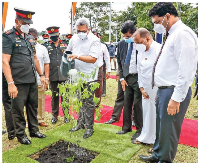
The 'Husma Dena Thuru' (Trees Giving Life) tree planting programme, aimed at planting 2 million saplings within the next 5 years, was inaugurated by President Gotabaya Rajapaksa yesterday. The President took part in the programme by planting a 'Sandun' tree in front of the Central Environmental Authority (CEA) premises in Battaramulla. Environment Minister Mahinda Amaraweera, Chief of Defence Staff, Commander of the Army Centre for Prevention of COVID 19 outbreak Lt. Gen. Shavendra Silva and Army Dr. Anil Jasinghe also participated. The programme aims at expanding the 0 percent of the land as envisaged in the 'Saubhagayya Dekma' manifesto. It is by the Environment Ministry, CEA, Army and the Defence Headquarters. Picture