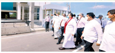
Prime Minister Mahinda Rajapaksa going on an inspection tour of the relocated and newly constructed Peliyagoda Market's Media Unit

"In addition, as its new location is a hub connecting the country's Express-