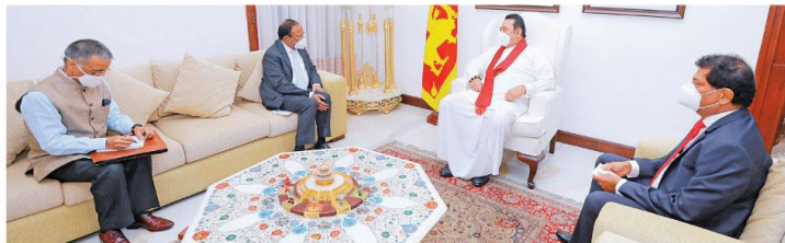
Visiting National Security Adviser of India Ajit Doval called on Prime Minister Mahinda Rajapaksa at the latter's official residence at Wijerama Mawatha in Colombo yesterday.

to the region's situation. Doval made these remarks