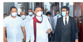
Former Minister and SLPP founder Basil Rajapaksa walking out of the Colombo High Court premises yesterday.