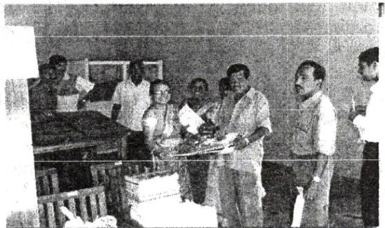
Donation of books to a tsunami affected library