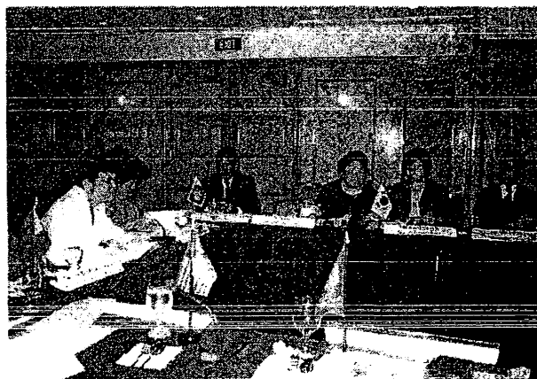
A session of the conference

Director of the National Library and Documentation Services Board participated the conference.