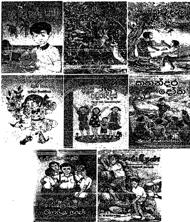
Tsunami children's books