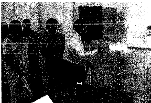
Open University Seminar