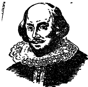
'SHAKSPERE' BRAND THE POWER OF A NAME