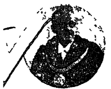
MAYOR BRAND THE NAME THAT COUNTS