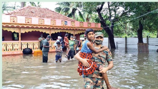
Military personnel helping civilians affected by floods in Jaffna due to Cyclone Burevi.