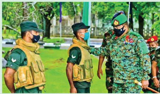
Making a quick visit to the heavy vehicle yard in the Security Force Headquarters - Wann, Head, National Operations Centre for Prevention of COVID-19 Outbreak (NOCPCO), Chief of Defence Staff and Commander of the Army Lt. Gen. Shavendra Silva on Wednesday inspecting the readiness of the emergency fleet and troops to meet any eventuality prior to the arrival of Cyclone Burevi. The elaborate disaster preparedness of the troops both helped minimize damage due to the cyclone and provide speedy relief to those affected.