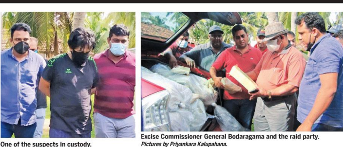
One of the suspects in custody.