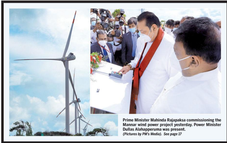
Prime Minister Mahinda Rajapaksa commissioning the Mannar wind power project yesterday. Power Minister Dulas Alahapperuma was present. (Pictures by PM's Media). See page 17