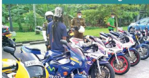
The bikes at the Mirihana Police station.