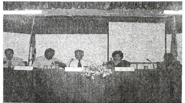
An inauguration of a seminar