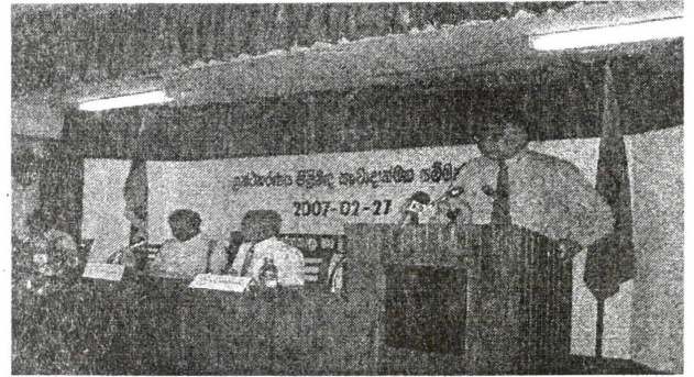
An Inauguration of a training programme