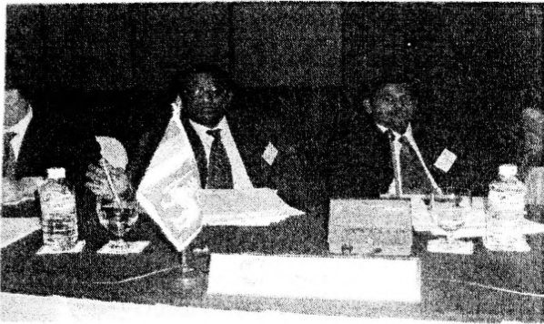
A session of the WIPO symposium