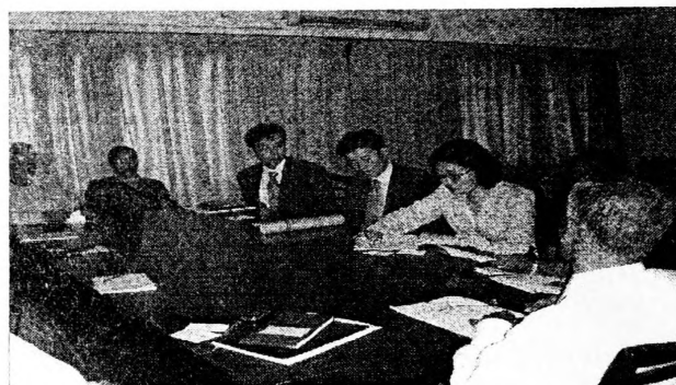
Korean delegation with the senior management of NLDSB