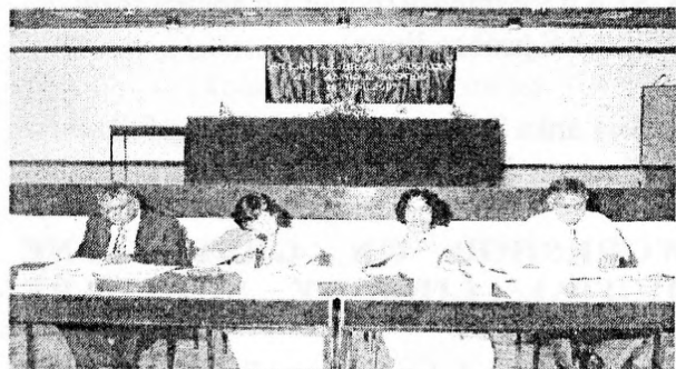
SLLA annual sessions