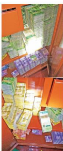
Bundles of currency notes found with the smugglers.