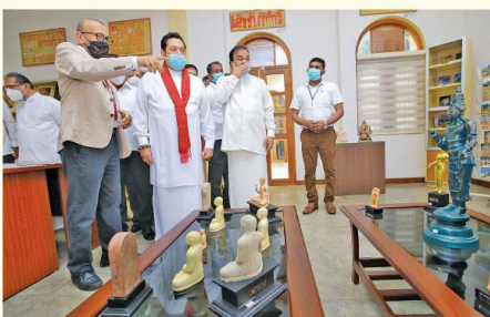
Prime Minister Mahinda Rajapaksa at the mural centre.

of buildings which are built at slopes, sudden appearance of springs, emerging muddy water and blockage or disappearance of existing springs. People should move immediately away from the areas where they notice the above pre-landslide signs," the NBRO advised. "People living in landslide susceptible areas should be extra vigilant and should be ready to move quickly to safe places if heavy rain continues," it added. Meanwhile, the Meteorology Department in its weather bulletin said heavy falls above 100mm can be expected at some places in Central provinces and in Badulla, Ampara and Batticaloa districts today. TO PAGE 02