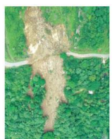
A landslide in the Walapane area early last year.

"During this Landslide Early Warning period, pay attention to development of cracks on the ground, deepened cracks and ground subsidence, slanting of trees, electrical posts, fences and telephone posts. The people are also requested to be vigilant on cracks in the floors and walls