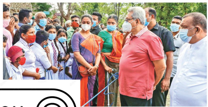
Kanugahawewa in Kebthigollawa to participate in the "Discussion with the Village" programme.

makes it very hard for the people to cultivate. It was thus decided to hand over the lands identified as residual forests when marking reserves according to the Google map after 2012 back to the people for cultivation purposes immediately. Residents of these villages had to live in welfare camps from 1995 to 1998 and from 2006 to 2008 due to terrorist activities. They still face a number of serious economic and social issues. The poverty ratio in the village stands at 54% of the total population. LTT attacks separate Neelawewa when a mine in 2006.