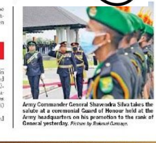
Army Commander General Shavendra Silva takes the salute at a ceremonial Guard of Honour held at the Army headquarters on his promotion to the rank of General yesterday.