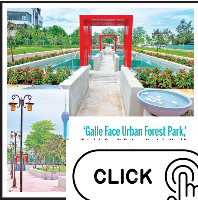
'Galle Face Urban Forest Park,'

He also pledged the support of all stakeholders in the industry to the Government for its endeavours to minimise the risk to the local community and stakeholders and to revive the tourism industry as it is the worst affected industry due to the pandemic. ▶ PAGE 02