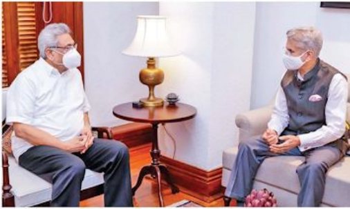
External Affairs Minister of India Dr. S. Jaishankar called on President Gotabaya Rajapaksa at the Presidential Secretariat yesterday.

India is ready to give priority to Sri Lanka when exporting the vaccines now being produced in India to prevent COVID-19, the External Affairs Minister of India Dr. S. Jaishankar told President Gotabaya Rajapaksa yesterday.