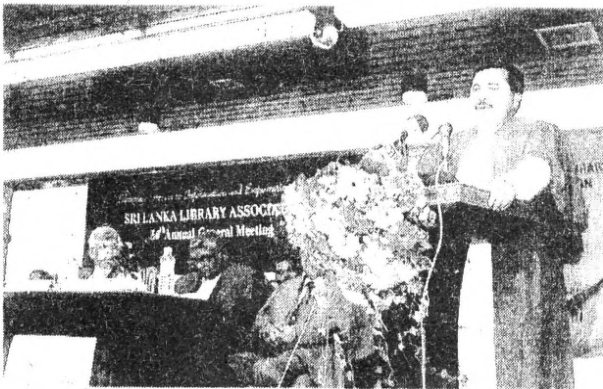
SLLA Annual General Meeting