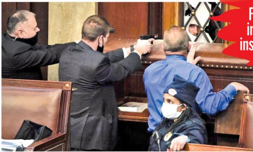
Federal agents draw their guns at the insurgents trying to break through a window of the Capitol Chamber.