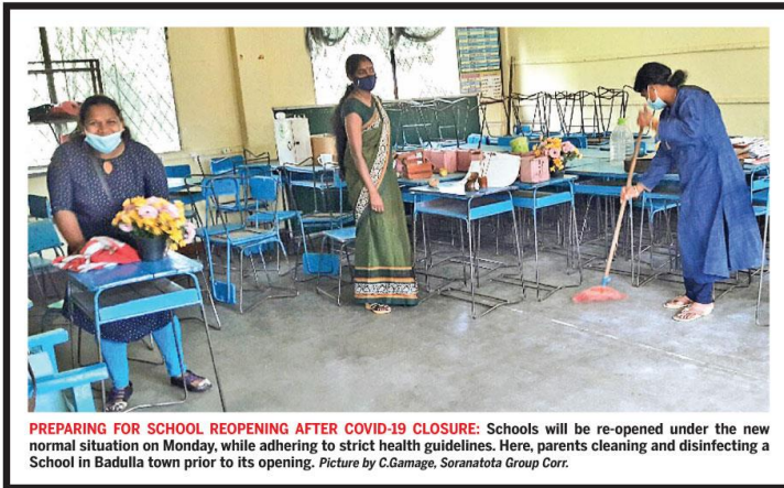
PREPARING FOR SCHOOL REOPENING AFTER COVID-19 CLOSURE: Schools will be re-opened under the new normal situation on Monday, while adhering to strict health guidelines. Here, parents cleaning and disinfecting a School in Badulla town prior to its opening.

He said the UGC was temporarily closed after a security guard and one of his associates was found COVID-19 positive. ▶ TO PAGE 02