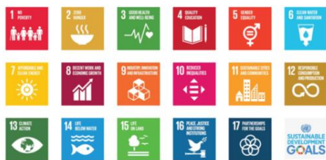
Figure 1: SDGs ( http://www.un.org/sustainabledevelopment/sustainable-development-goals/ )