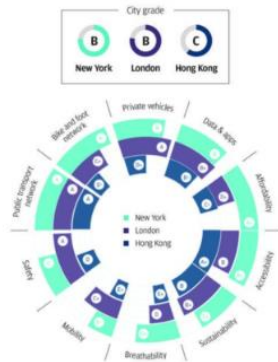
Figure 5: Image showing environmental comparison of Hong Kong with London and New York

making it most dominant mode of transportation. As per the Hong Kong government fact sheet, since 2007, Rail which includes MTR, East Rail, West Rail, Light Rail, and Airport Express has become the biggest passenger carrier making it a backbone of public transport of Hong Kong. On the other hand, private transport takes up only 10% of passenger trips. Not only this but Hong Kong's modern metro system allows riders to use 3G internet in all tunnels and stations enhancing the digital capabilities of their metro and bus networks.