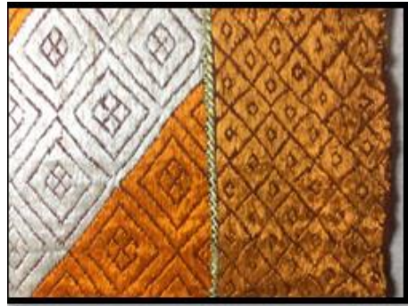
Plate 2: A detailed view of Bagh

adapting machine printing, machine embroidery and painting by a just few geometric motifs which have flooded the markets. The fineness of the craftsmanship in a few handmade phulkaris found today is very diminutive. There are a few ngo's and government organizations who are working on the revival of the craft but the efforts taken are not even ten percent matching the required rank. Hence the main aim of this paper is to unleash the consciousness about the craft amongst the people of Delhi.