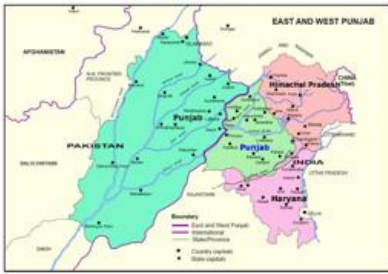
Plate 1: A part of map of India indicating areas practicing phulkari embroidery

Partition had affected this craft incalculably; it had forced the craft to die an atrocious death. People lost everything in partition. They were looking for the food to satisfy their hunger why would they sit and embroider phulkari anymore. Left with nothing they then started trading this craft as a commodity for the monetary gains. This commercialization led to striking time saving patterns. It also adopted cheaper materials, lack of fineness in craftsmanship which in-turn destroyed the genuine spirit of Phulkari. There after today what we see in the market is even the deteriorated version of this craft. The choices of fabrics used today are no-where closer to what was then. To meet the demands of the market and to keep up with the changing times people have adapted to the finer fabrics like chiffons, silk, fine cotton and even georgette to be used as a base fabric for this craft. The colour palette can be customized in any colour, shade required. The designs and the patterns can also be customized. In the time which is so advanced than the past the technologies the expertise is somehow not being wisely used. The wholesalers and the retailers have made enough dents by experimenting every possibility to exploit the craft. The exploration with fabrics and the colours is still enduring, but negligence to the motifs which is the key aspect of this craft is a solemn concern. The craft has been commercialized by