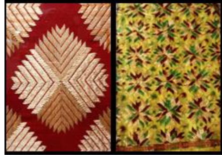
Plate 3: An example of phulkari then and now Source: (Left) Display piece at National Handicraft and Handloom Museum Delhi (Right) chiffon saree machine embroidered with multi colour viscose rayon threads, photographed at researcher's close relative.