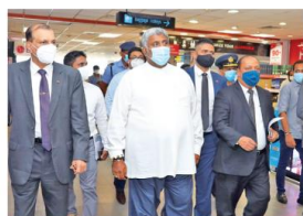
Tourism Minister Prasanna Ranatunga and AASL officials at the Bandaranaike International Airport yesterday.

14 PASSENGER, CARGO AIRCRAFT TO LAND AT BIA TODAY