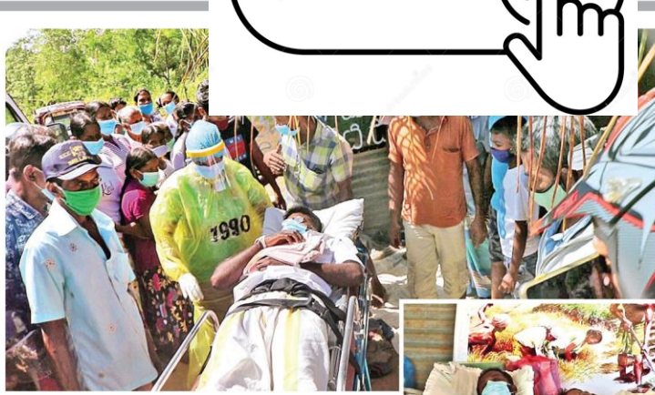
Two farmers among several farmers on a fast unto death in Hambantota protesting for action against the elephant menace in the district and to gazette the elephant management plan were taken to hospital yesterday due to their deteriorating health condition. The farmers initially launched the protest on Monday (18).

The Centre said it has recorded 887 persons to be infected with the virus within the 24 hour period from Thursday to Friday (22), of whom 13 were identified as Sri Lankans who came to the country from overseas, and one foreign national who came to the country. ▶ TO PAGE 02