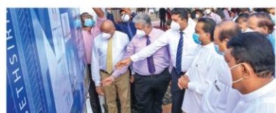
Minister Wimal Weerawansa, State Minister Dr. Nalaka Godaheewa and Ministry officials after the ground breaking ceremony. traffic congestion. Speaking Minister Wimal Weerawansa

This construction will see several offices of public institutions in one location to provide an efficient public service and easy access to services to the people under the "Vision of Prosperity" policy