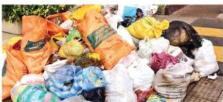
Filephoto of garbage collected in the sidewalks in Colombo.