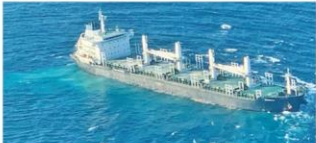
The stranded 'MV Eurosun' off the Sri Lankan coast.