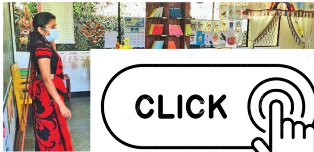
Covered desks provided for progress at a hygienically designed