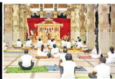
An All-Night Pirith Chanting ceremony was held at the Independence Memorial Hall at Independence Square, Colombo, under the patronage of Defence Secretary General Kamal Gunaratne to mark Sri Lanka's 73rd Independence Day. The Independence Day ceremony will be held today at the same location.