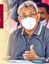
President Gotabaya Rajapaksa in Deraniyagala on Saturday.

remarks participating in the "Discussion with the Village" programme held on Saturday at the Dickellakanda Junior College in the Dickellakanda Grama Niladhari Division in the Deraniyagala Divisional Secretariat Division in the Kegalle District. ▶ TO PAGE 02