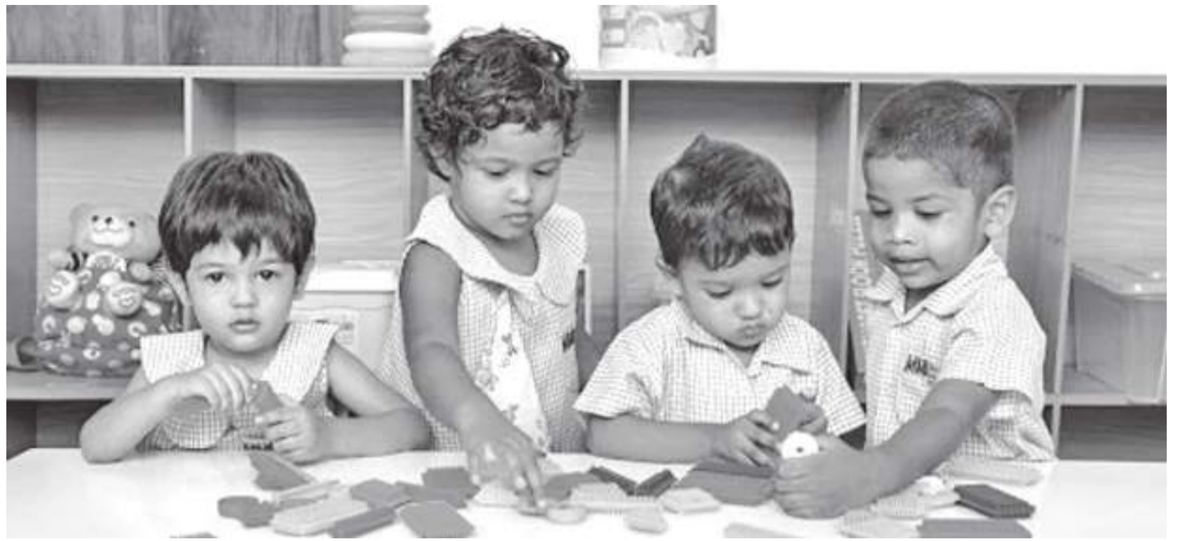
Learning a language can be fun.