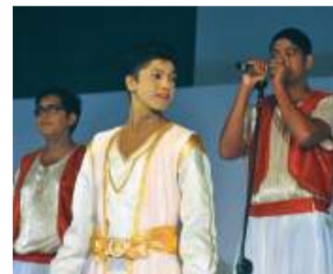
Taking part in the choir