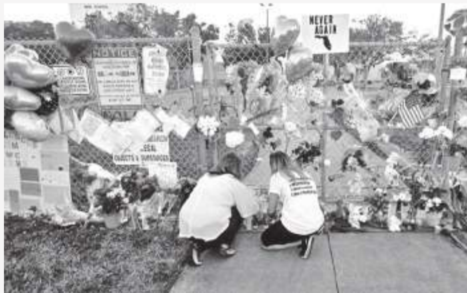
People light candles at a makeshift memorial outside Marjory Stoneman Douglas High School, where 17 students in the faculty were killed in a mass shooting in Parkland, Florida in 2018.

The confessed school shooter, Nikolas Cruz, who was 19 at the time, was armed with an AR-15-style rifle and fired between 100 and 150 rounds in a rampage that killed 14 students and three adult staff at the Marjory Stoneman Douglas High School.