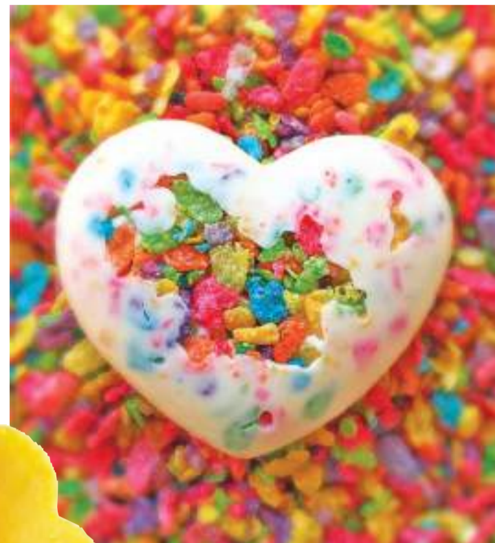
Chips in a heart