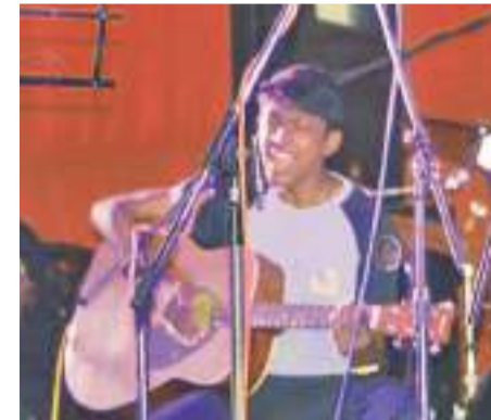
Playing the guitar at a musical show