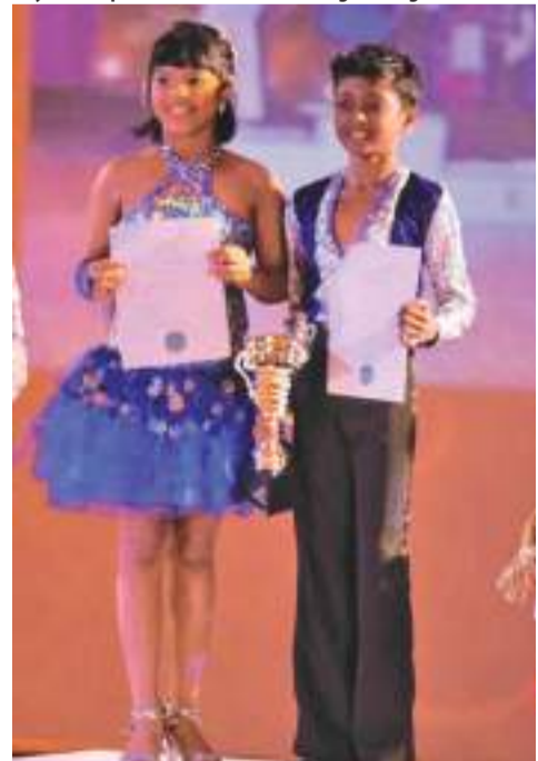
Winning a dancing competition

"For example, when working together in a corporation, there will be a large number of employees working under a few leaders. When there is a task that needs to be done, all the employees will be required to contribute. The employees are the people who need to take charge of the entire process and make sure that the deadline will be met. If each and every single employee has that sense of leadership, that spark of leadership within them, they will be able to make the correct decisions during this process without having to consult their line manager or anyone superior. This is something that great leaders