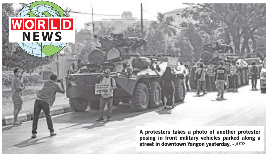
A protesters takes a photo of another protester posing in front military vehicles parked along a street in downtown Yangon yesterday.

Extra troops were seen in key locations of Yangon, the nation's commercial hub and biggest city, including