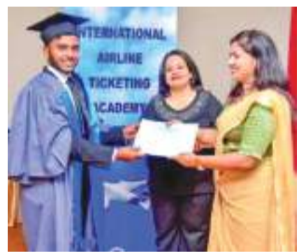
Receiving Certificate from Ticketing Academy