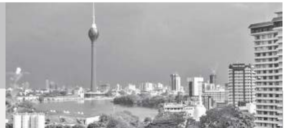
The Lotus Tower

at the business level of local talent. The majority of executive levels Sri Lankan's were educated overseas and are fully internationalized.