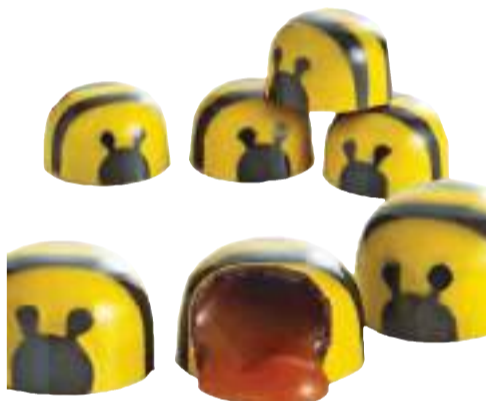
Chocolate bees with caramelized honey center