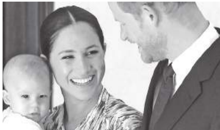
Prince Harry, Meghan Markle and baby Archie Harrison.

A Buckingham Palace spokesman said: "Her Majesty, Duke of