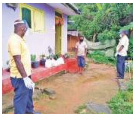
Dry rations were distributed among 392 quarantined families in the Medadumbara Divisional Secretariat recently under the guidance of the Divisional Secretary. Each pack was worth Rs.10,000 and was enough to feed a family for two weeks.