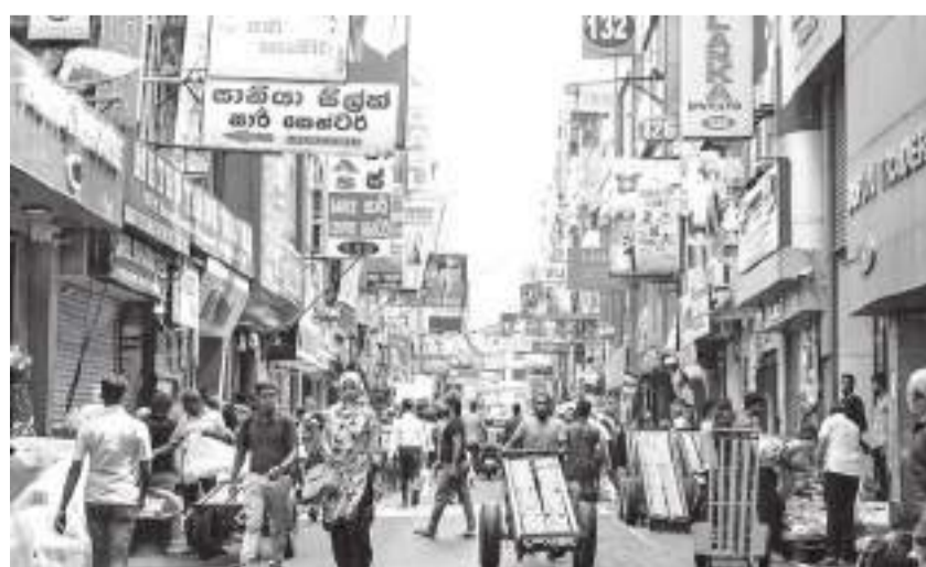
A bustling street in Pettah, Colombo.