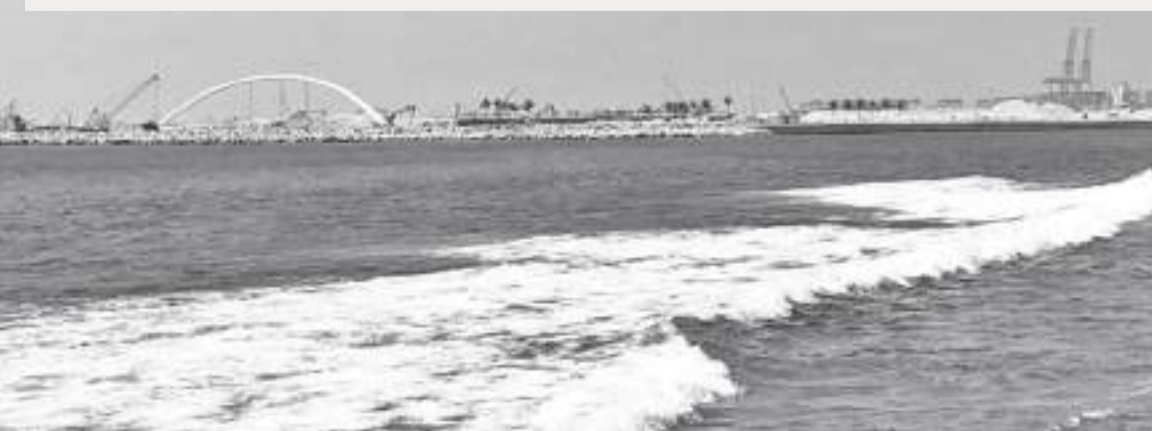
The Colombo Port City under construction