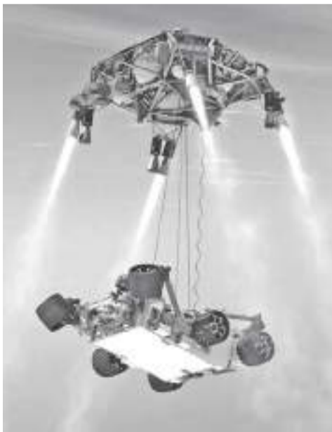
NASA Mars rover Perseverance reaches final arc of descent.

Much is riding on the outcome. Building on discoveries of nearly 20 U.S. outings to Mars dating back to