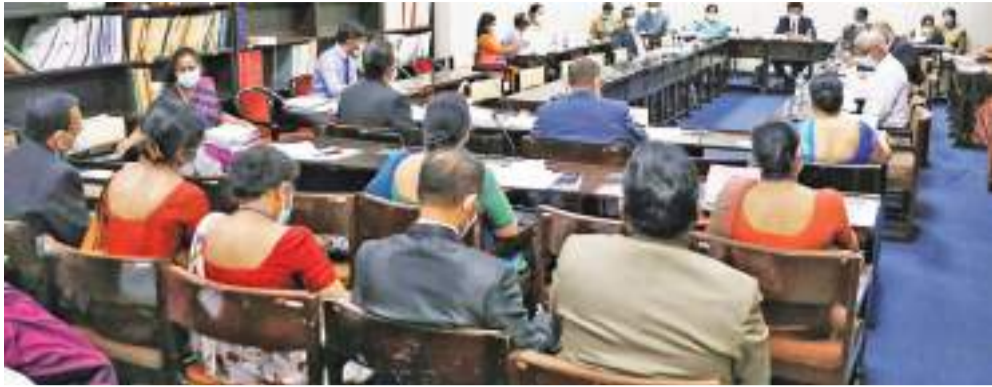
Participants at the meeting.

Although the National Child Protection Authority has data on complaints, the committee also noted the lack of a national database on child abuse. The committee directed that steps be taken to develop a more for-