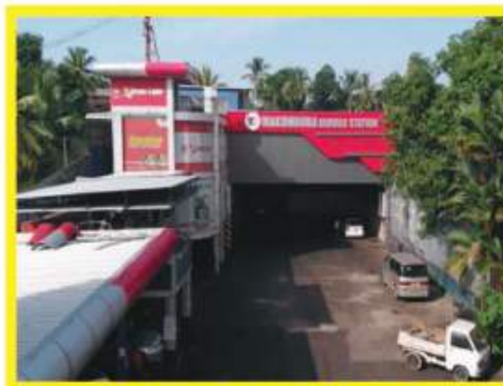
Makumbura Service Station

"Starting and building a business is always a challenge, but having a great support system gives you the motivation to overcome every hurdle. HNB's support empowered me to do what I do best - take a hands-on approach to my business and build relationships with my customers. I have expanded the small service station my father started, but the relationships I have built with my clients is what I am most proud of. I am excited to see my son continue this legacy and create his own success story as the 3rd generation owner of the Makumbura Service Station."