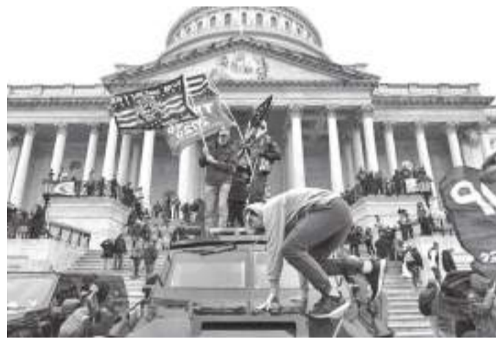
Rioters outside Capitol Hill in Washington D.C. on January 6.

Senator Bill Cassidy of Louisiana was one of the seven Republicans to vote to convict; he predicted Sunday that Trump's still-strong hold on Republicans would