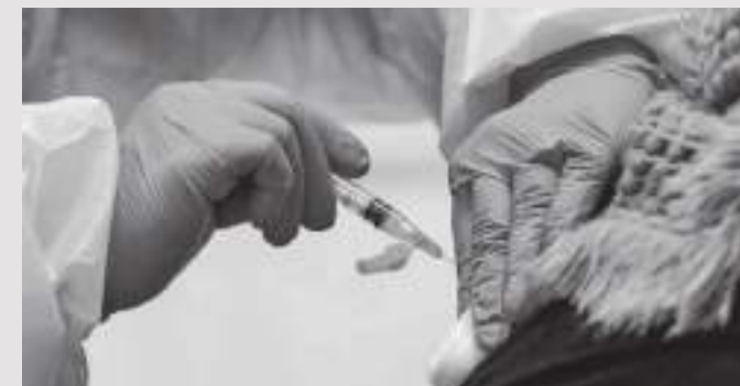
UN Secretary-General Antonio Guterres has repeatedly called for vaccines to be treated as a "global public good".