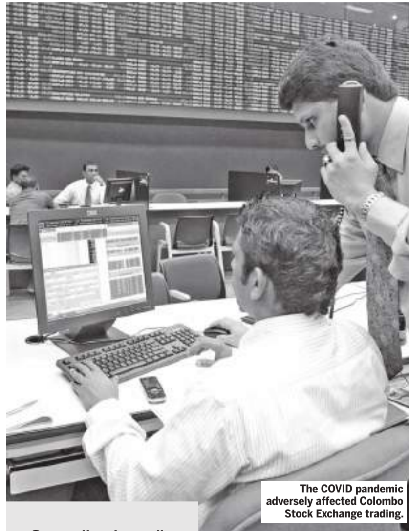
The COVID pandemic adversely affected Colombo Stock Exchange trading.

Market mechanism cannot be neglected in any economic governance system as the bureaucracy is not the god to solve basic economic problems connected with mobilization of resources to satisfy human needs and wants. The public is prepared to accept economic outcomes of competitive demand and supply forces if they are transparent with fair market prac-