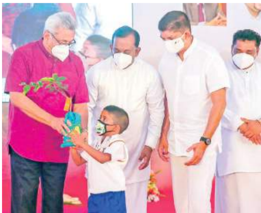
President Gotabaya Rajapaksa launched the National Tree Planting Programme for Children Kekulu Tharu Udanaya at the Atabage Wimaladharmas National School in Gampola yesterday. Here, the President presents a sapling to a Grade One student.

State Minister Shashindra Rajapaksa said that the central theme of this concept is to create a sound mentality by encouraging the students, who are in