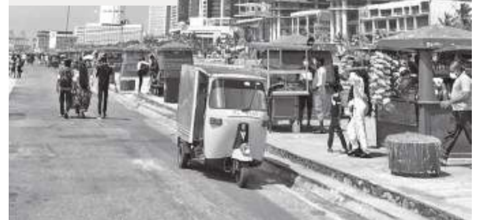
Colombo's changing skyline

With Colombo developing as a South-East Asian Service Centre and possessing an airport, port, and CBD that looks West, and the Hambantota airport, port, and SEZ's looking East and South, Singapore will have competition.