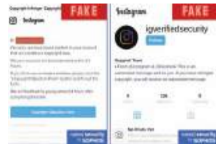
Left: Fake email 'copyright warning' pretending to be from Instagram. Right: DM claiming to be from an official Instagram account. (Note 13,000 'followers' but 0 posts!) Right: Use 'Privacy' option on the Instagram Settings page to make your account private. Right. Toggle the 'Private account' slider on.

and more. But there's always an excuse why the scammer wasn't able to get the visa, or board the flight, or do whatever they said they would. "Sudden travel restrictions due to Covid-19 regulations have apparently become a popular excuse during the coronavirus pandemic. The scammer will continue asking for money for as long as the person at the other end continues to send it," the researchers noted. Don't use the same password as you do on any other sites, they urged. "If you think you may have given away your password on a fake site, change it as soon as you can before the crooks do. Consider using a password manager if you don't have one already," the researchers advised. "As much as it seems to be common to share a lot of your life on Instagram nowadays, you don't have to give away everything about yourself. Also think about who or what is in the background of your photos before you upload them," they added.