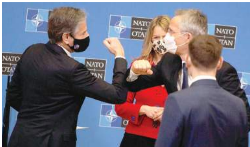
NATO Secretary General Jens Stoltenberg (R) elbow bumps with U.S. Secretary of State Antony Blinken ahead of a NATO Foreign Ministers meeting in Brussels on Monday.

oustment and arrest of civilian leader Aung San Suu Kyi.