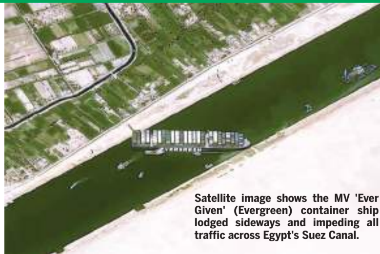
Satellite image shows the MV 'Ever Given' (Evergreen) container ship lodged sideways and impeding all traffic across Egypt's Suez Canal.

route, for example, is 6,000 kilometres (3,700 miles) and up to two weeks shorter than going around Africa. Nearly 19,000 ships passed through the canal last year