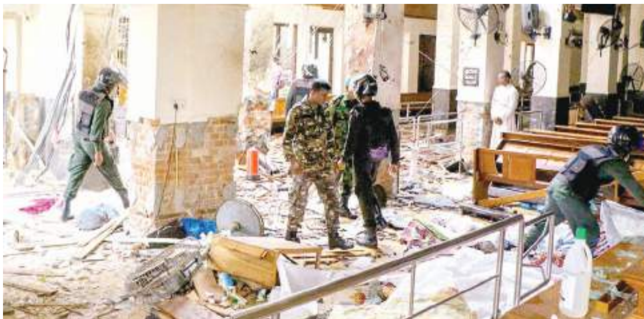
Easter Sunday terror attacks.

We are now inured to the bustling security guards, the multiplicity of investigations and the endless inquiries. What in other countries would be a rarity, has become commonplace here. However, we provide intrusive security, conduct unending investigations and end up with long drawn out trials. In the public perception, all these activities are illusory, more an intimidation, a drama which has lost the plot. Meanwhile, justice is sinned against, again and again.