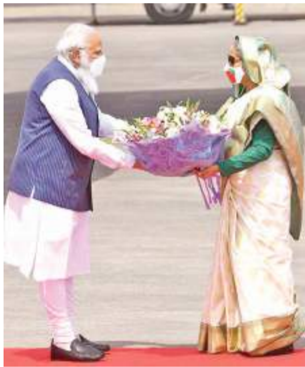
In this photo provided by Prime Minister of India Narendra Modi's twitter handle, Indian Prime Minister Narendra Modi receives a bouquet of flowers from Bangladesh's Prime Minister Sheikh Hasina in Dhaka, Bangladesh yesterday, to join celebrations marking 50 years of the country's independence.

Still, and despite COVID-19 case numbers rising in recent weeks, Dhaka has held 10 days of celebrations culminating on Friday for Independence Day in the presence