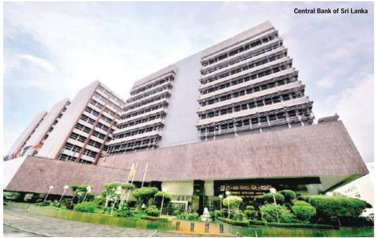
Central Bank of Sri Lanka

With a satisfactory system of justice seemingly beyond the nation's capabilities, perhaps even at odds with its cultural imperatives, our visitor would think that the citizens of this country would have lost their taste for legal processes. But not so, if he looks at any newspaper he will see that more inquiries are afoot; parliamentary committees, presidential commissions, special audits are working around the clock to untangle a hopelessly tangled web of deceit. It