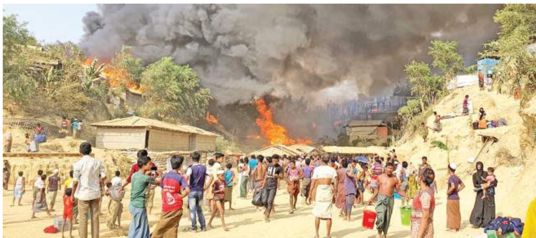
Smoke rises following a fire at the Rohingya refugee camp in Balukhali, southern Bangladesh on March 22, 2021.

Details of the COVID-19 spread and deaths are: World - 124,894,108 infected (2,745,702 deaths). US - 30,011,551 (545,282). Brazil - 12,220,110 (309,685). India - 11,787,534 (160,692). France - 4,374,785 (93,083). UK - 4,326,645 (186,624). Italy - 3,440,862 (106,339). Spain - 3,234,319 (73,744). Germany, Poland, Austria and other European countries are also facing a sharp rise in infections, and partial lockdowns are being imposed in the Easter holiday period.