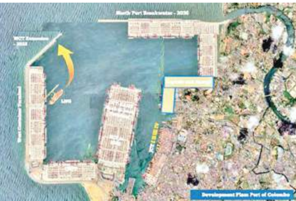
West Container Terminal

In fact, talk of neutrality has become a staple on President Rajapaksa’s agenda. In another typical instance late last year, he told a group of foreign diplomats that since “Sri Lanka is located in a place of strategic importance (...) our country is attracted to many parties. In this context, Sri Lanka has chosen neutrality as its foreign policy (...)”