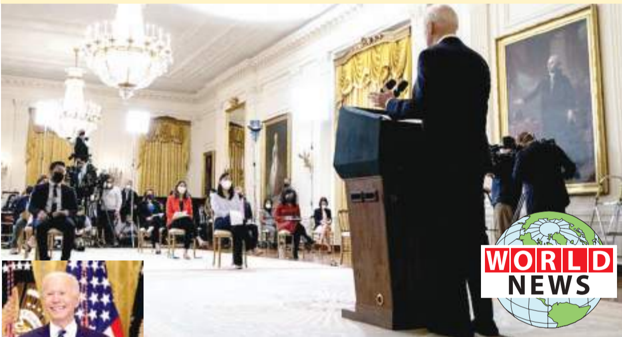
US President Joe Biden speaks during a news conference at the White House, on Thursday.