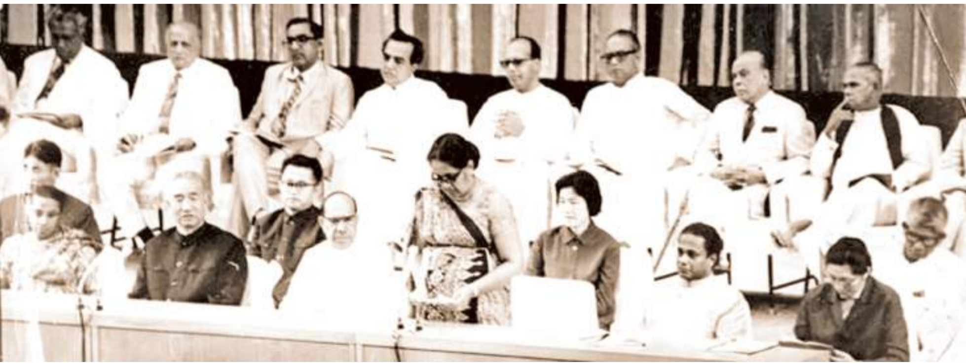
Madam Sirimavo Bandaranaike, the Chairperson addresses the fifth Non-Aligned Summit held in Colombo in 1975

mer is a well-defined status under international law, with several hundred years of precedents in the realms of trade, military affairs, and humanitarianism. Non-alignment, on the other hand, is a purely political concept, which lost some relevancy due to the end of the Cold War and the fact that de-colonization — one of the NAM’s core topics — is less and less an issue 70 years after most former colonies gained their independence. That is another reason why President Rajapaksa does not need to worry much domestically when he alludes to neutrality, which is a typical European concept of great power balancing.