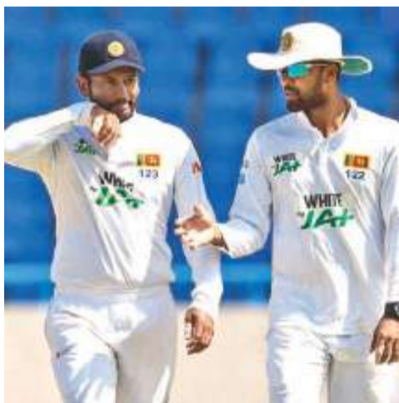
Sri Lanka Test Captain Dimuth Karunaratne (L) and Dinesh Chandimal.