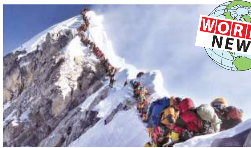
A long queue of mountain climbers line a path on Mount Everest during the 2019 climbing season.

In 2019, the traffic-clogged spring climbing season saw a record 885 people climb the peak, 644 of them from the south and 241 from the northern flank in Tibet. The season ended with 11 deaths on the mountain, with at least four blamed on overcrowding. - AFP