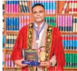
He is also a recipient of the Mahatma Gandhi Global Award in 2019 and Deshabandhu title in 2018.

product of Prince of Wales College, Moratuwa and completed his Masters and Bachelor Degrees in Logistics Management from reputed universities in the country.