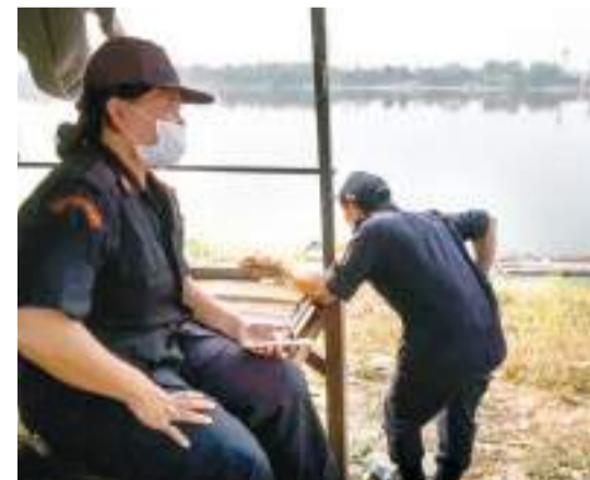
Village watchmen on the Mekong river are Thailand's first line of defence against a fresh methamphetamine influx from Myanmar.

Synthetic drug production is already the number one revenue source for several insurgent groups and militias