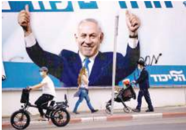
Israel's never-say-die Prime Minister Benjamin "Bibi" Netanyahu.

Bennett, a multi-millionaire former high-tech entrepreneur who made a name in politics with hard-line religious-nationalist rhetoric, has so far not declared which way he will jump. If Netanyahu can't reach a deal with Bennett and his opponents cannot unite, a fifth election is possible. - AFP