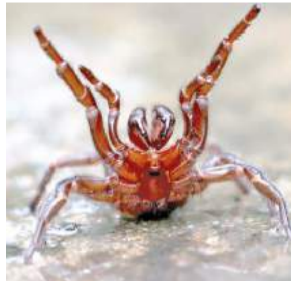
The funnel-web spider is one of the world's most venomous arachnids.