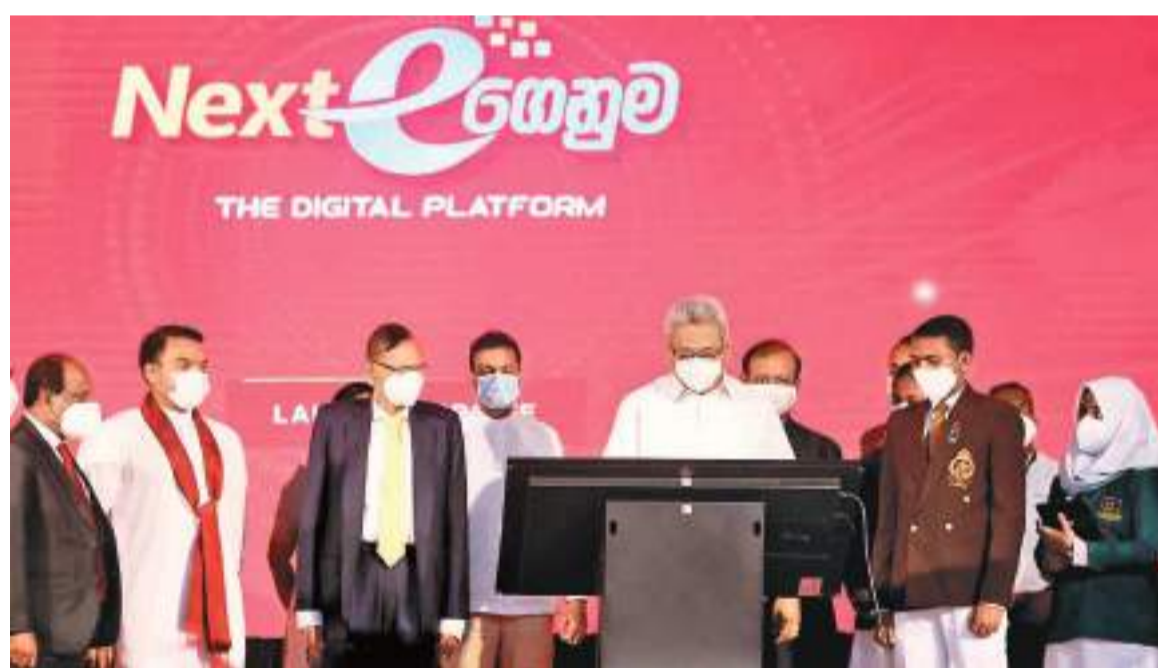
President Gotabaya Rajapaksa launching the "egunama.moe.gov.lk" website and digital platform at Temple Trees yesterday which will enable the public to electronically submit their proposals on education reforms under the broad topics of pre-school education, primary, secondary and tertiary education and professional and higher education, for the next three months. Ministers Prof. G.L. Peiris and Namal Rajapaksa are looking on.