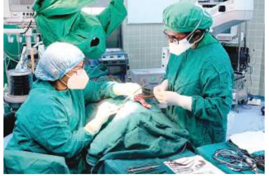
Doctors at performing the implant

to profound hearing loss in both ears or those who receive less or no benefit from hearing aids. In light of all that has happened over the past year, access to hearing and hearing healthcare is more important now than ever. Hearing connects people, and access to sound for those with hearing loss is important for connection as we continue to socially distance ourselves to mitigate the COVID 19 virus. As such, this surgery marks the first step towards creating a safe environment to those with hearing impairment. The pandemic conditions under which the successful first procedure was conducted, reinstates the qualitative standards that the local healthcare system has, as one of the most affordable and best services in the Asian region.