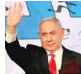
Israeli Prime Minister Benjamin Netanyahu

Saudi Arabia has presented a new peace initiative to end the war in Yemen, including a nationwide ceasefire and the reopening of air and sea links, but its Houthi enemies said the offer did not appear to go far enough to lift a blockade. The initiative announced by Saudi Foreign Minister Prince Faisal bin Farhan Al Saud, would include reopening Sanaa airport, and allow fuel and food