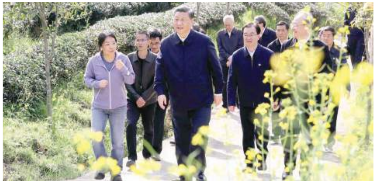
General Secretary of the Communist Party of China Central Committee and President Xi Jinping learns about local efforts to develop the tea industry while visiting an eco-friendly tea garden in Nanping City, Fujian Province.