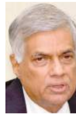
Former Prime Minister Ranil Wickremesinghe

What did the Prime Minister do? He first disparaged those raising questions, suggesting they would not know the difference between sovereign bonds and James Bond. Neither an economist, nor a secret agent fighting international