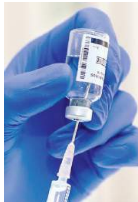
A healthcare worker prepares a Pfizer coronavirus disease (COVID-19) vaccination.

India recorded more than 50,000 new coronavirus cases on Thursday for the first time since November, and aims to inoculate 300