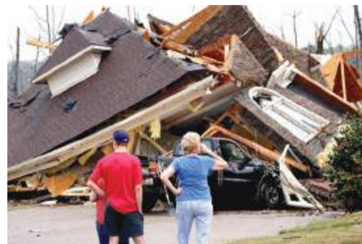
Residents survey the damage to homes after a tornado hit the town of Birmingham in Alabama, damaging a number of homes on Thursday.

The sheriff's office said on Facebook that there had been significant damage in Calhoun County and advised residents to stay home and off the roads as more storms were expected.