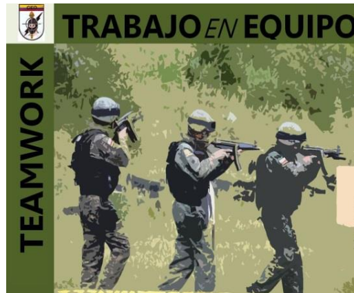
Figure 1 - Posters