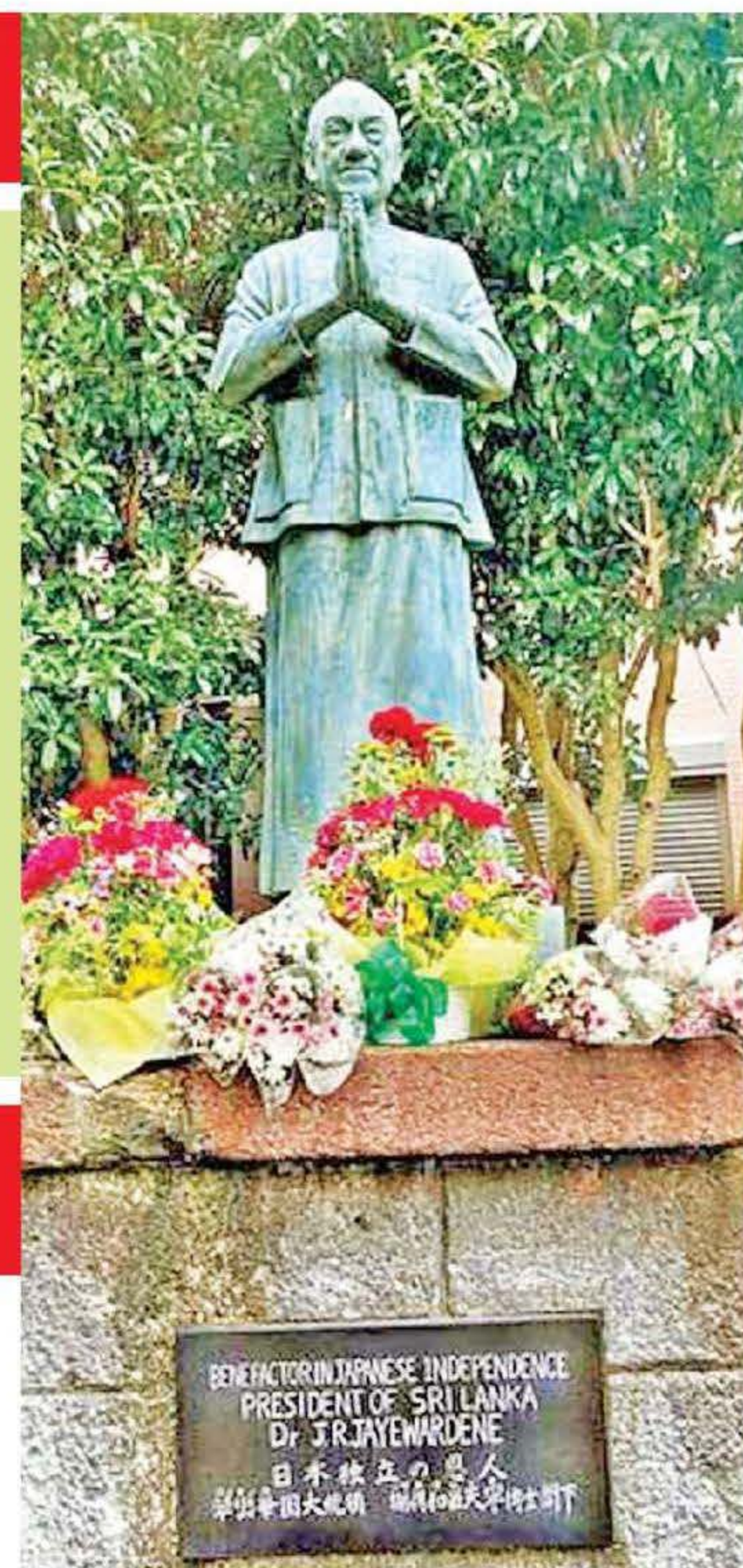
The statue of President J.R. Jayewardene in Japan

The New York Times noted that Sri Lankan Finance Minister J.R. Jayewardene's speech "the voice of free Asia, eloquent, melancholy and still strong with the tilt of an Oxford accent, dominated the Japanese Peace Treaty Conference today."