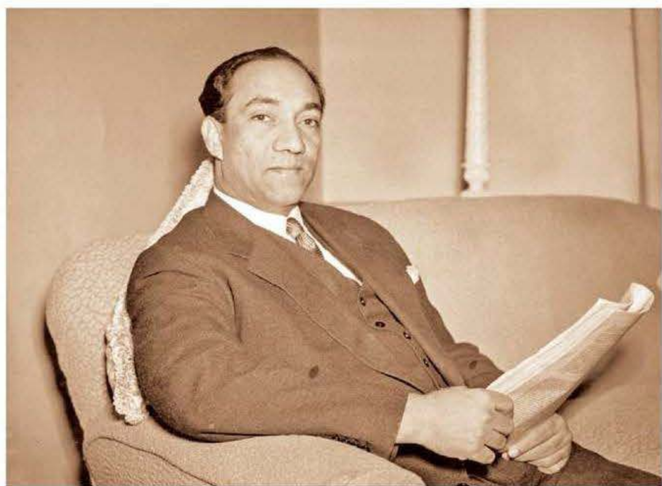
Finance Minister (later President) J.R. Jayewardene