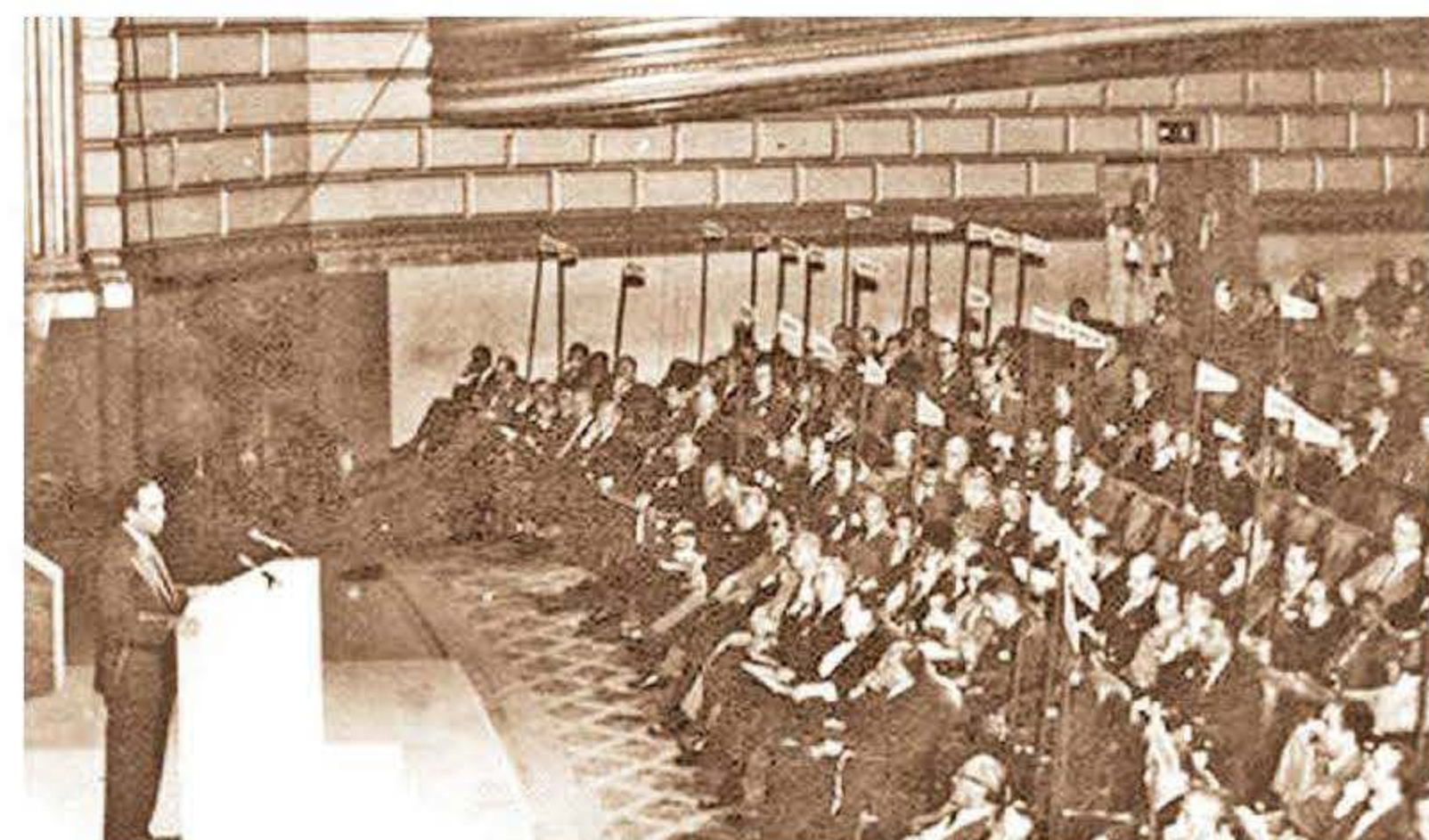
J.R. Jayewardene addressing the San Francisco Peace Conference