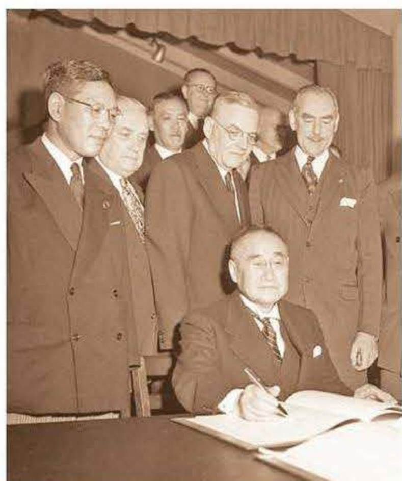
The signing of the San Francisco Peace Treaty

It is the message of the Buddha, the Great Teacher, the Founder of Buddhism, which spread a wave of humanism through South Asia, Burma, Laos, Cambodia, Siam, Indonesia and Ceylon, and also northwards through the Himalayas into Tibet, China, and finally, Japan, which bound us together for hundreds of years with a common culture and heritage. This common culture still exists, as I found on my visit to Japan last week on my way to attend this Conference; and from the leaders of Japan, Ministers of State as well as private citizens, from their priests in the temples, I gathered the impression that the common people of Japan are still influenced by the shadow of that Great Teacher of peace, and wish to follow it. We must give them that opportunity."