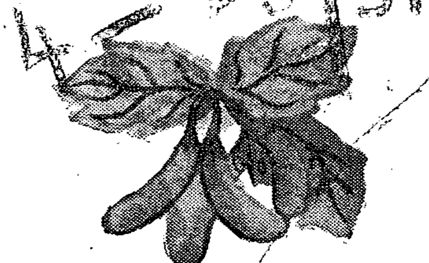
BRINJAL brand tea