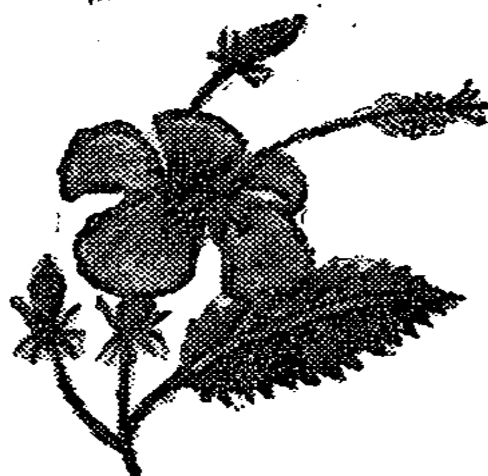
SHOE FLOWER Brand Tea