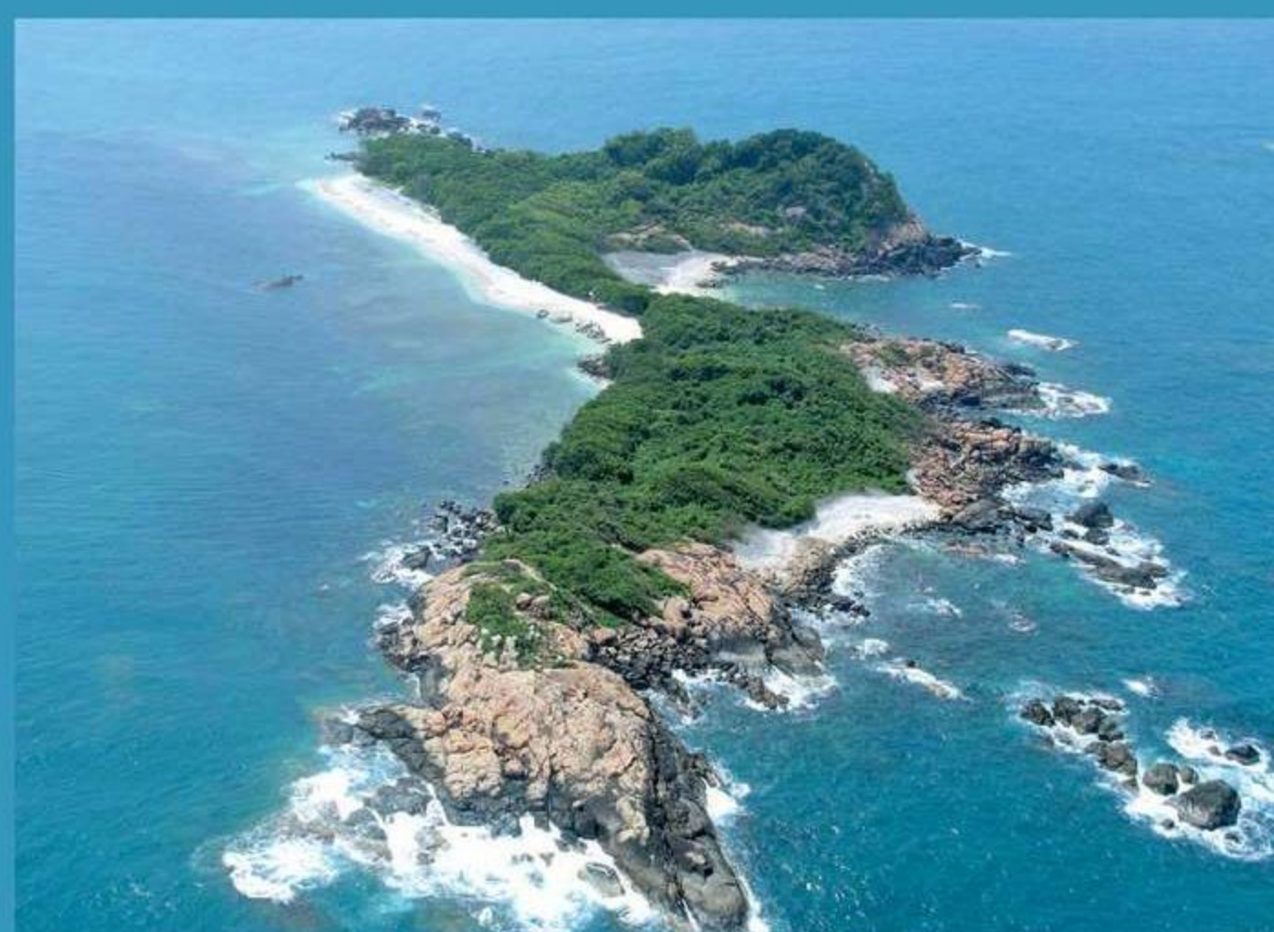
Rare Blue rock pigeons live here