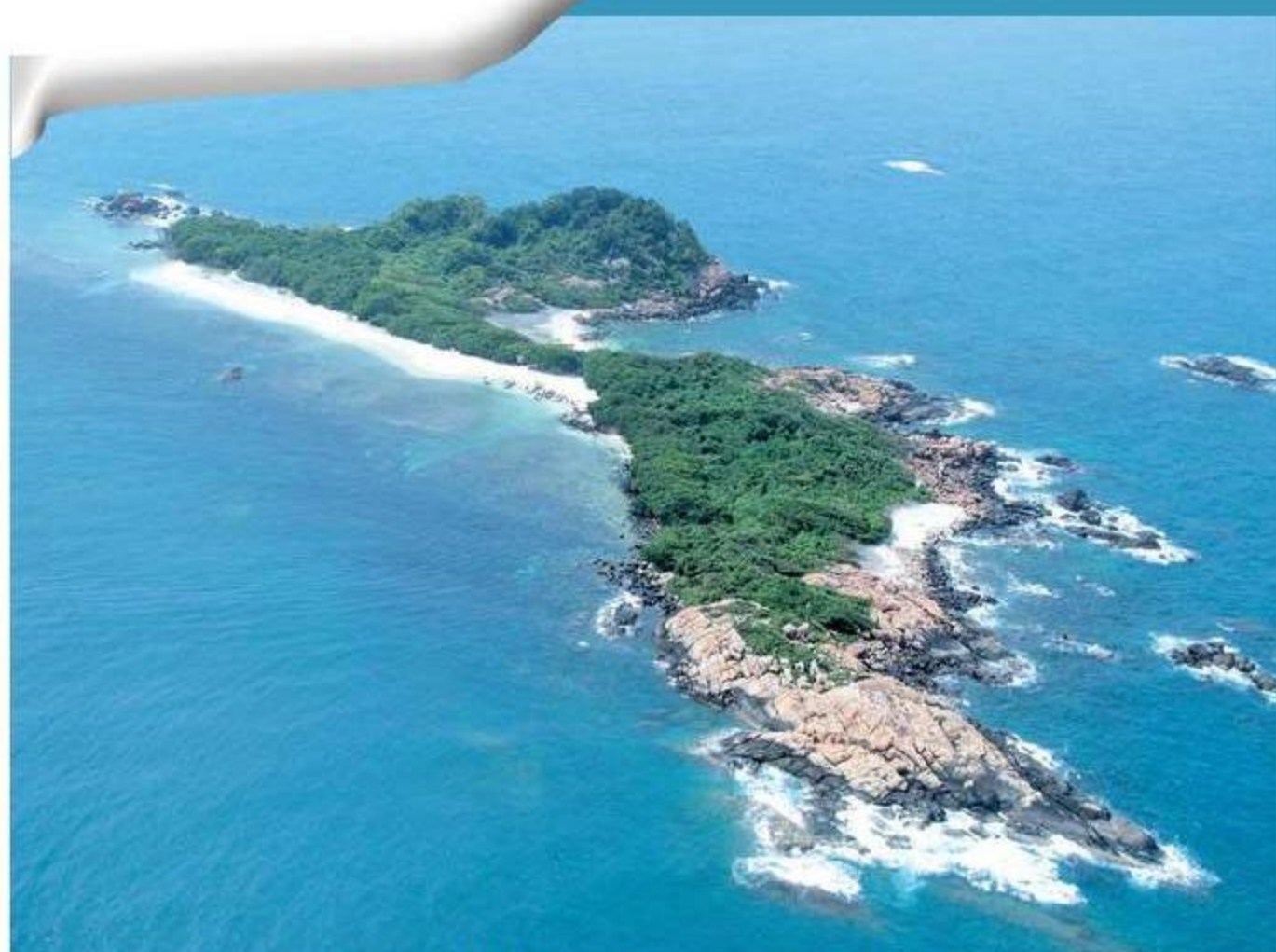
Snorkel of Dive: this is a beautiful spot