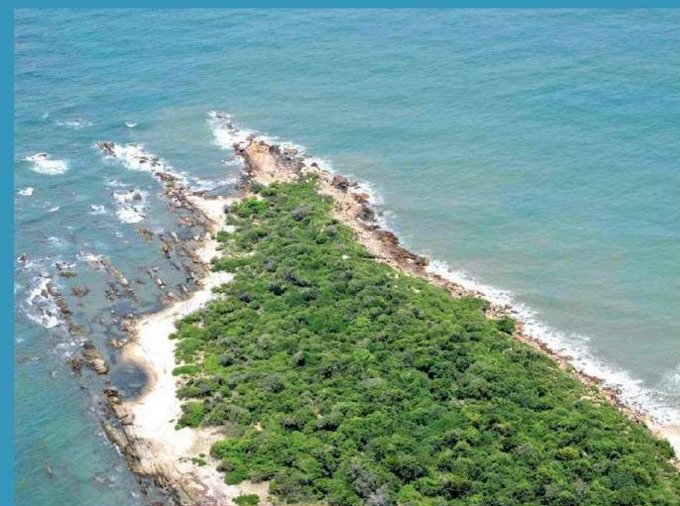
Pigeon Island looks great seen from the sky