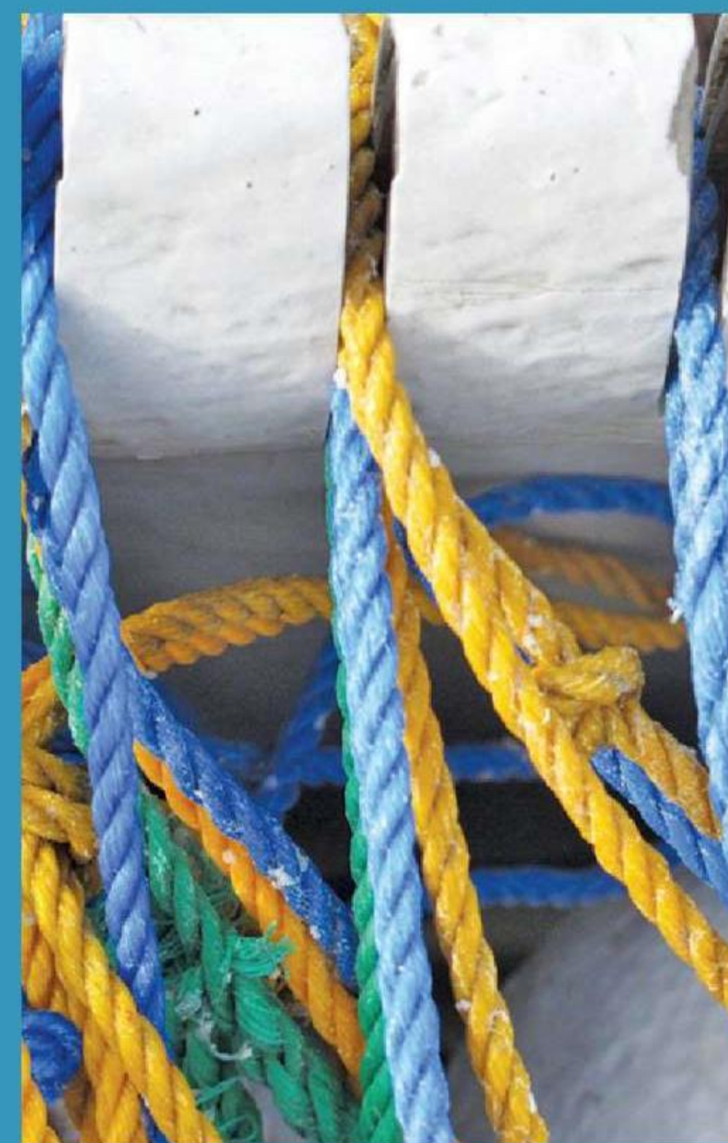
Great spot for arty fishing shots