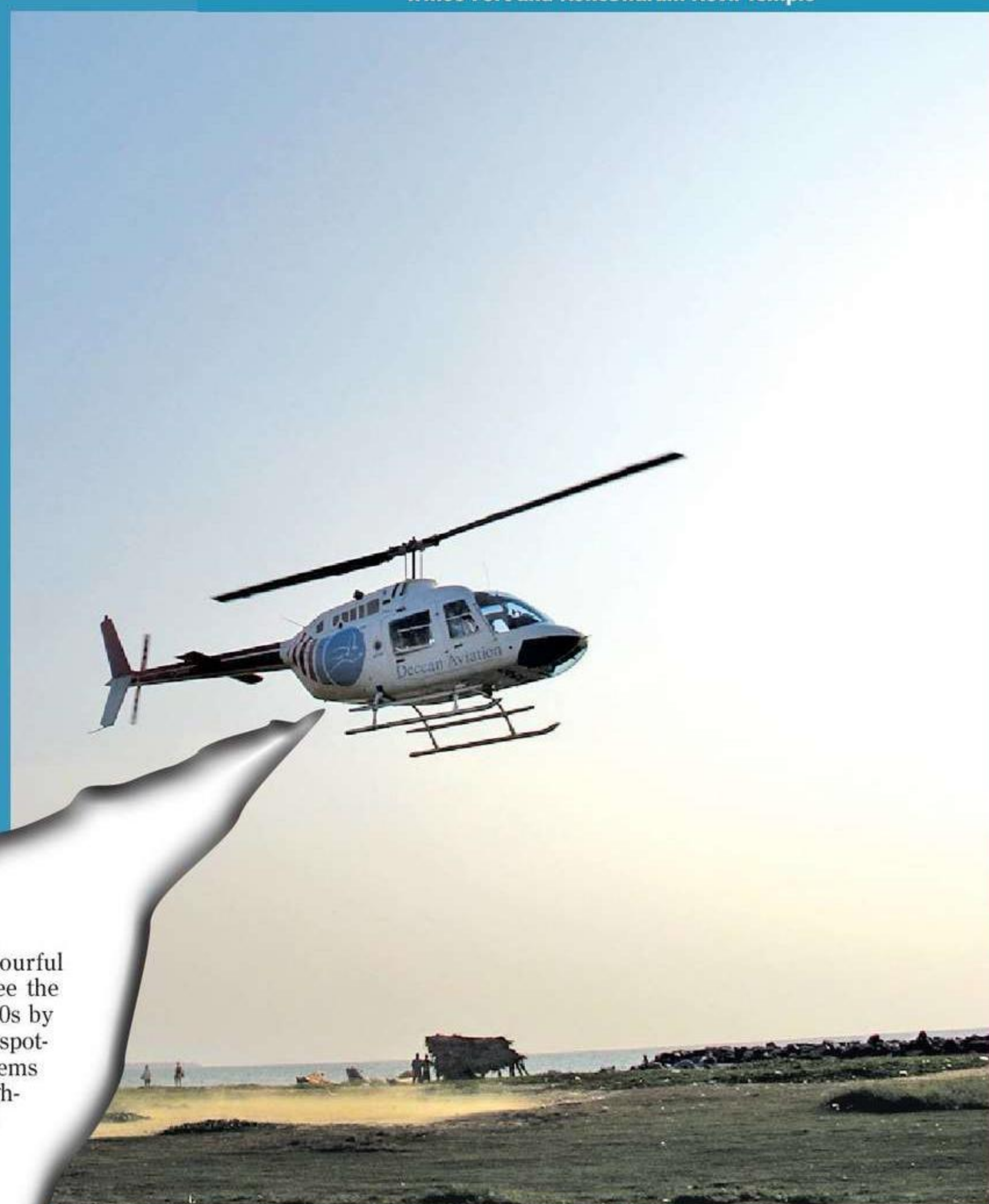
Hire a helicopter and see it from the sky