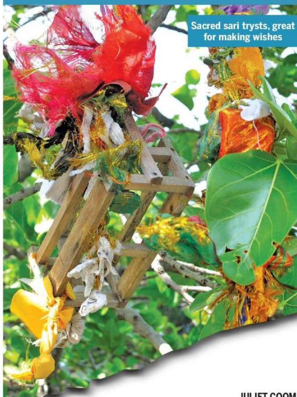
Sacred sari trysts, great for making wishes