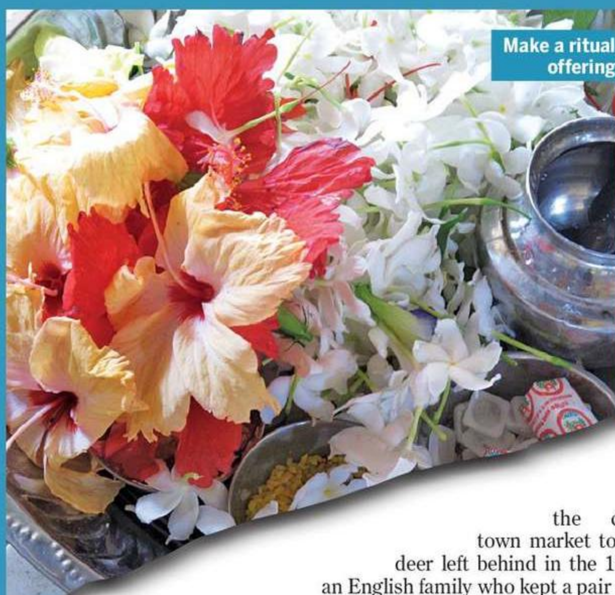
Make a ritual offering