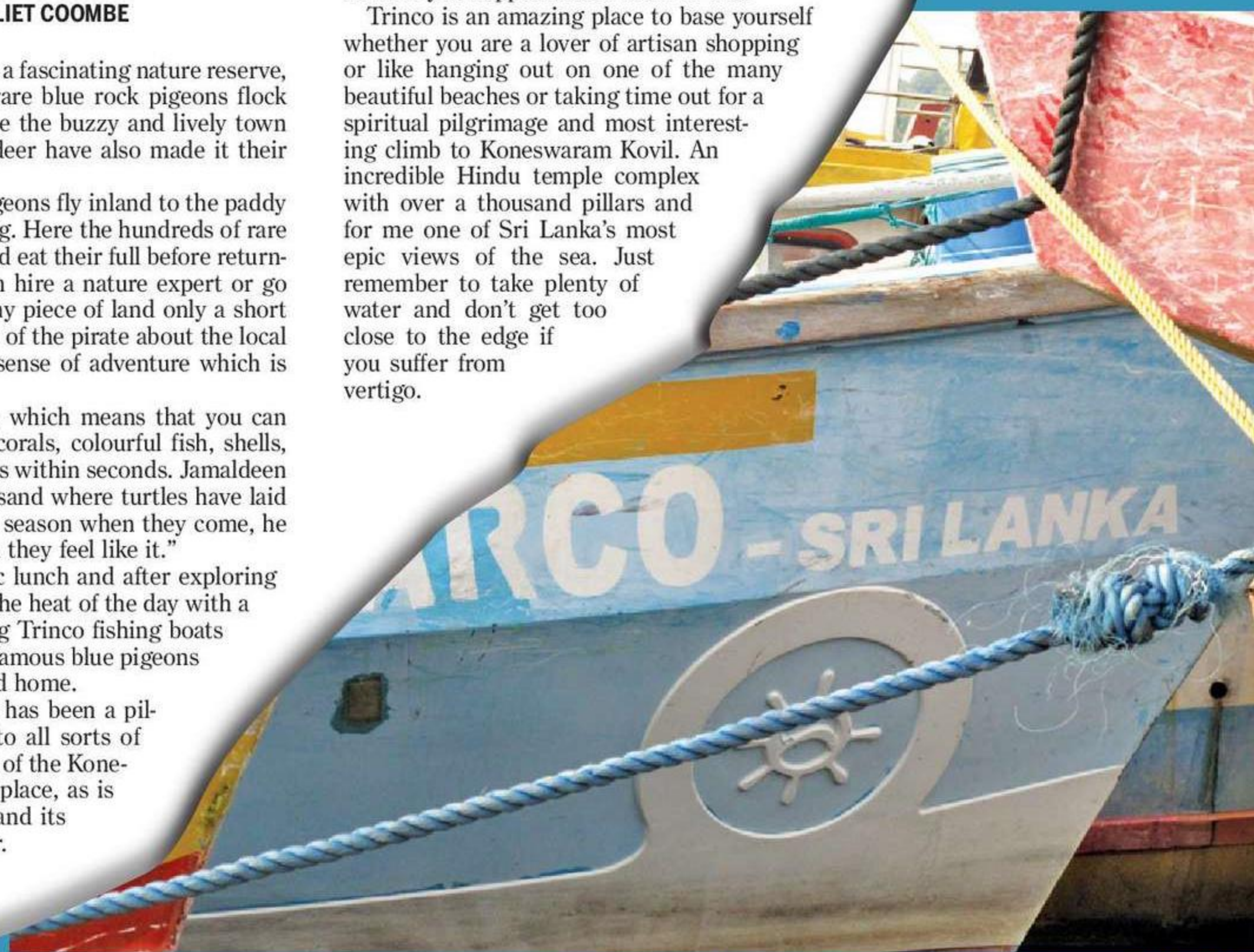
It is a great way to discover this amazing wildlife reserve by fishing boat

Trinco is an amazing place to base yourself whether you are a lover of artisan shopping or like hanging out on one of the many beautiful beaches or taking time out for a spiritual pilgrimage and most interesting climb to Koneswaram Kovil. An incredible Hindu temple complex with over a thousand pillars and for me one of Sri Lanka's most epic views of the sea. Just remember to take plenty of water and don't get too close to the edge if you suffer from vertigo.