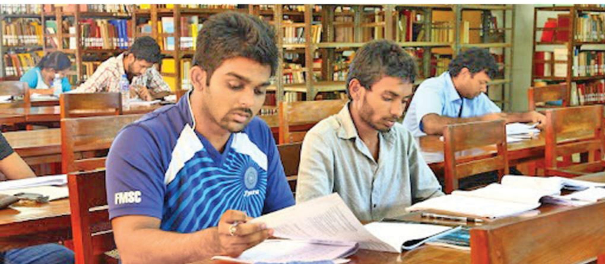
Students at Jayawardenepura University